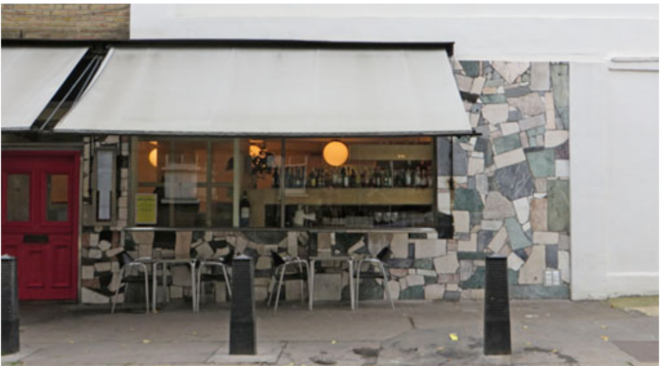
Rugby Street façade of Cigala.