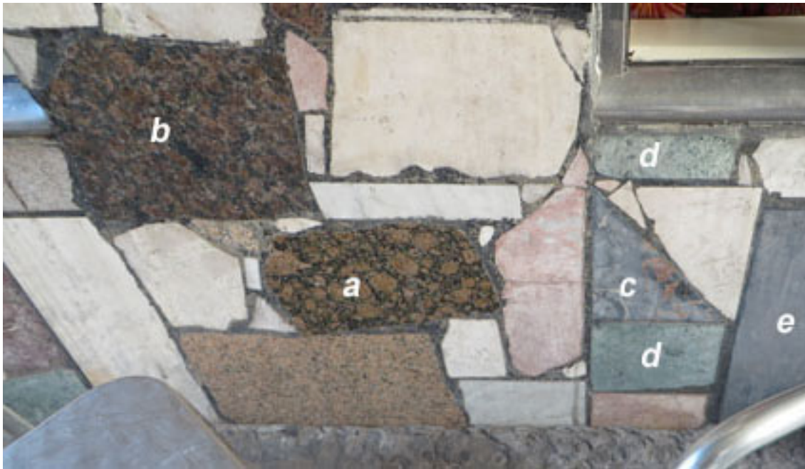
Lamb's Conduit Street façade; a). Baltic Brown, b). Indian Brown Granite, c). Portoro, d). green serpentinite, e). black limestone.

temperatures and pressures. They are composed of quartz, potassic feldspar and mafic minerals characteristically orthopyroxene and/or hornblende. Charnockites occur in Scandinavia, North America, Canada, South Africa and Australia, but they were first described in India by geologist T. H Holland in 1900, after he had observed the stone on the mausoleum of Job Charnock at St John's Church in Calcutta. Holland was later able to identify these rocks in the field.