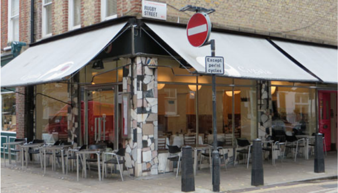
Cigala Restaurant, 54, Lamb's Conduit Street.

cross cut by white calcite veins occurs in the middle of the final panel of crazy paving on Rugby Street. The main current producers of black limestone are the Carboniferous strata of Belgium and Ireland. Famous examples include Belge Noir, Bleu Belge, Kilkenny Black and Galway Black. Black limestone forms in an anoxic ocean environment and the colour is imparted by abundant, but finely disseminated particles of carbon, plus or minus iron pyrite, in addition to their main component, calcite. Fossils of crinoids or shells may also be present.