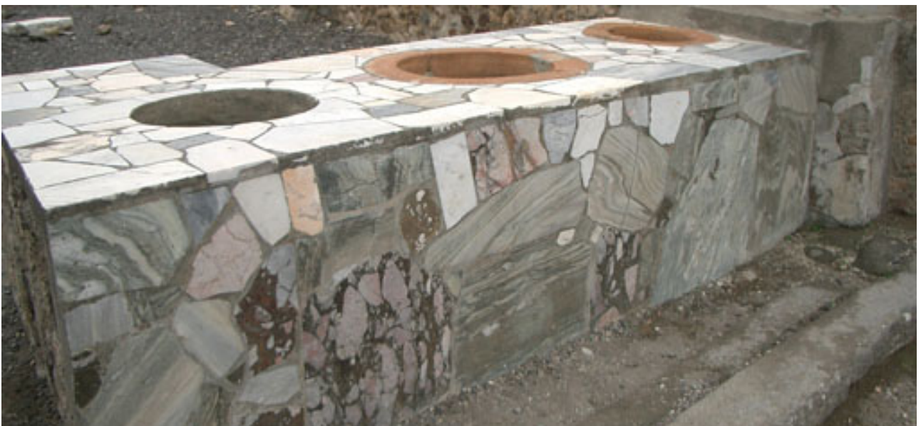
Thermopolia in Pompeii showing dolia set in crazy-paved, marble clad counters. The lower image shows the counter front clad primarily in marmor carystium (Cipollino) from the Island of Euboea (Evia) in Greece and marmor Luculleum (Africano) from western Turkey.