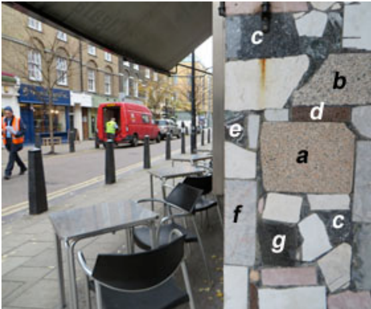
The corner of Rugby Street & Lamb's Conduit Street; a). Rosa Porriño, b). Rosa Sardo Ghiandone, c). Blue Pearl Larvikite, d). Balmoral, e). Rosso Levanto, f). grey limestone breccia, g). Rustenburg Bon Accord.

Most prized are the pink marbles, sometimes with streaky, black and dark green veins and blotches. The pink marbles occur as lenses in units of white marbles. The colour is imparted by finely disseminated particles of the red iron-oxide hematite. The darker markings are serpentine-group minerals. The Estremoz marbles have been quarried since the Roman period and have been identified in many archaeological sites in Roman Lusitania. Now they are popular for bathroom décor, but are also spectacularly used to clad buildings. Several slabs of the salmon pink variety with black serpentine-rich veins are common on the façade of Cigala.