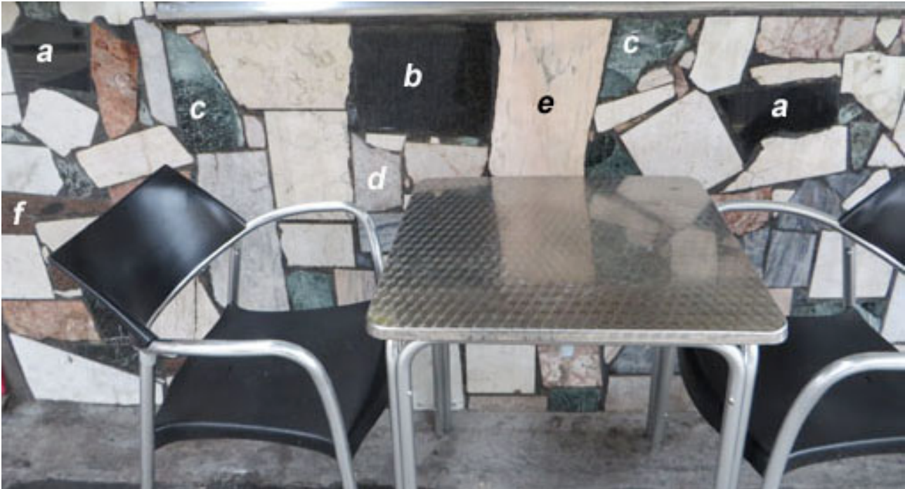
Rugby Street façade; a). Belfast Black, b). Rustenburg Bon Accord, c). green serpentinite, d). Napoleon, e). Rosa Portogallo.

dissolution under pressure of the limestone. The quarries (of which there are many in the Custonaci area) have been worked since the mid 20 th Century and have become very popular as kitchen and bathroom fittings as well as architectural cladding.