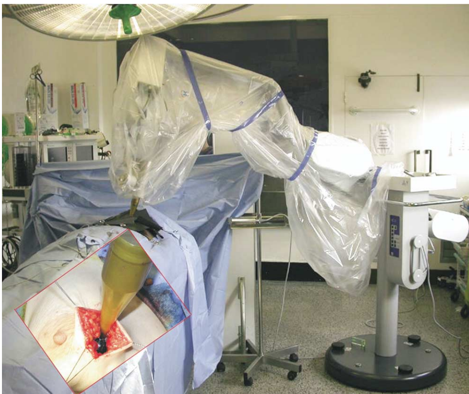
Figure 2 The Intrabeam system with the X-ray source in the breast wound (inset) and the electron generator and accelerator held in place by the articulated arm. The inset shows how the target breast tissue wraps around the applicator, giving true conformal radiotherapy. (Color version of figure is available online).