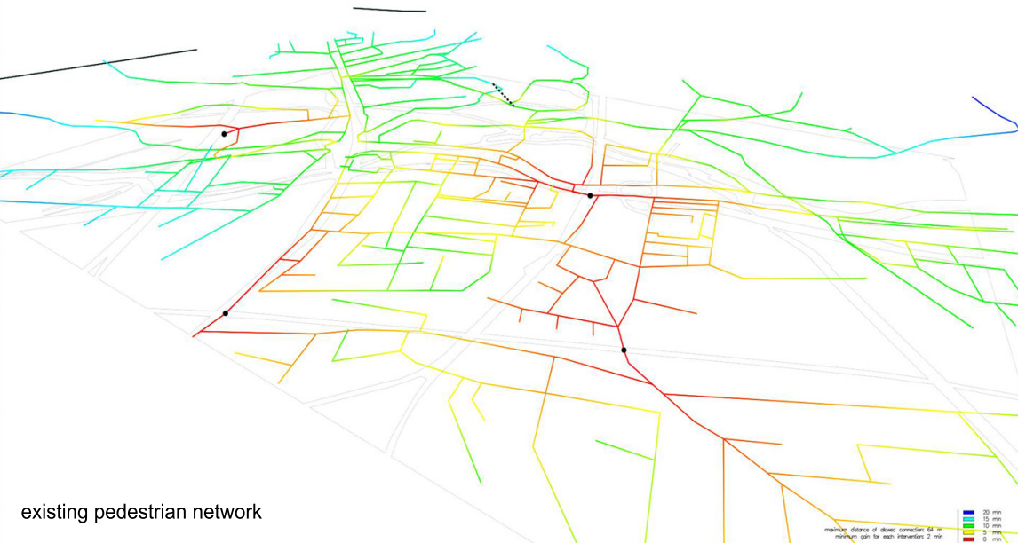
existing pedestrian network

The Pedestrian Network Connectivity modeller was developed for SSSP to enhance pedestrian walking access to main activity nodes. The user sets a distance and time for the application to find weak links within the network of routes and propose new links within the network. Essentially, it helps to improve the connectivity and accessibility within the network automatically.