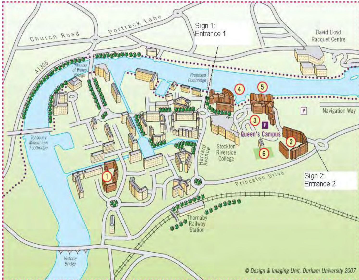
Queen's campus plan, from Estate Strategy 2011 - 2020