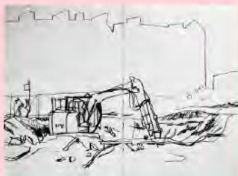
Saturday 8 th June 2013, 4:00 pm Phase One development site, re-named Trafalgar Place by the developers, used to be part of the Heygate Estate. Pencil on paper - A6 sketchbook.