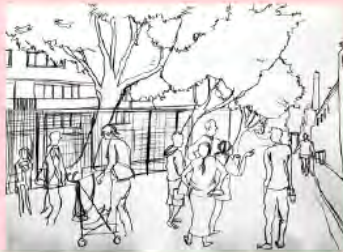
Saturday 8 th June 2013, 2:20 pm Wansley Street SE17. To the left is the fenced off Heygate Estate. Pencil on paper - A6 sketchbook.