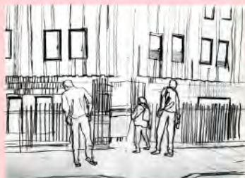
Saturday 8 th June 2013, 3:00 pm Garland Court, Wansley Street SE17. The first replacement homes, built as part of the E&C regeneration, consist of an equal balance of private and social housing, like most of the street. Pencil on paper - A6 sketchbook.