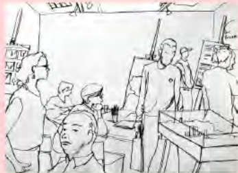
Saturday 8 th June 2013, 2:00 pm Interior, Soundings Hub, 182-184 Walworth Road SE17 Pencil on paper - composite view from sketches.