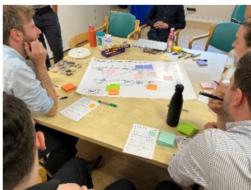
Figure 2: One of the discovery workshops with healthcare professionals in progress.

The participants represented a wide range of experiences, services and backgrounds and included rehabilitation engineers, occupational therapists (OTs), physiotherapists and physiotherapist technicians (figure 2).