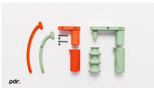
Figure 3: A high-fidelity render showing the modular construction of a concept for DDM AT.

A team of product designers was briefed on the concept and brought their expertise to some of the AT prototypes previously developed by the project's lead researcher. They enhanced the products' aesthetic appeal and improved the modularity of the design. High quality 3D physical models as well as high-fidelity renders and animations were produced (figure 3) along with a video illustrating the new system.