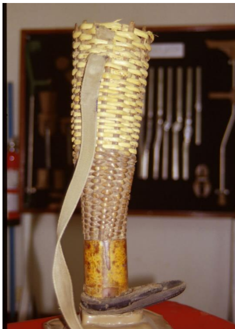
Figure 2: Wicker prosthetic socket from Cambodia.

The participants thought flexible sockets would be good, both in terms of enabling those with limb-loss the freedom to reduce areas of high pressure and relieving pressures to defiler services from the P&O centre, which was struggling financially. Additionally, the following avenues were discussed as possible solutions: