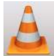
VLC Media Player

Use VLC Media player to playback video content from your computer with closed captions: