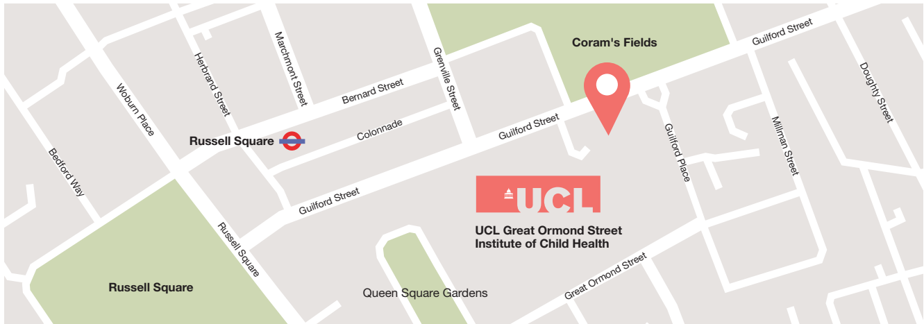
Location of conference venue (above). Floorplan of UCL Great Ormond Street Institute of Child Health (GOS ICH) (below).