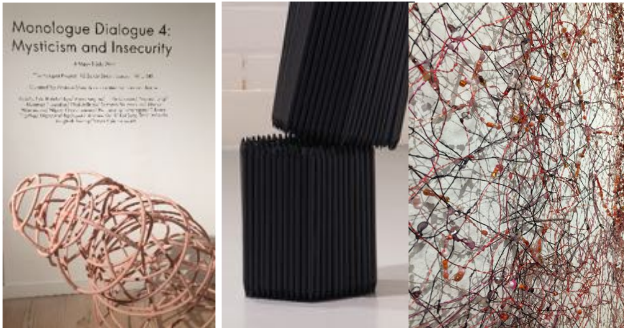
Left-right: Shameless (Miranda Housden 2017), Spellbound (Jedsada Tangtrakulwong 2017, close-up), Trans-Pollock (Be Takerng Pattanopas 2017, close-up).