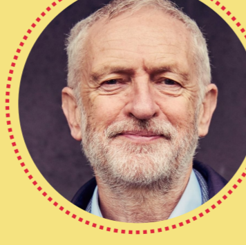
Jeremy Corbyn Member of Parliament of the United Kingdom