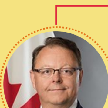
Benoit Préfontaine High Commissioner of Canada in Bangladesh, in Dhaka