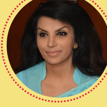
Saida Muna Tasneem High Commissioner for Bangladesh to the United Kingdom, Permanent Representative to IMO