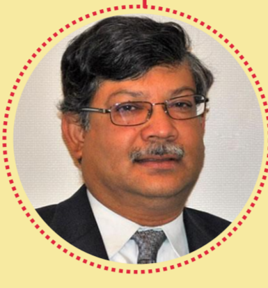
Masud Bin Momen The Foreign Secretary, Ministry of Foreign Affairs, Bangladesh