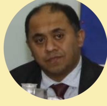
Hla Myint Rohingya Intellectual Group Sydney, Australia