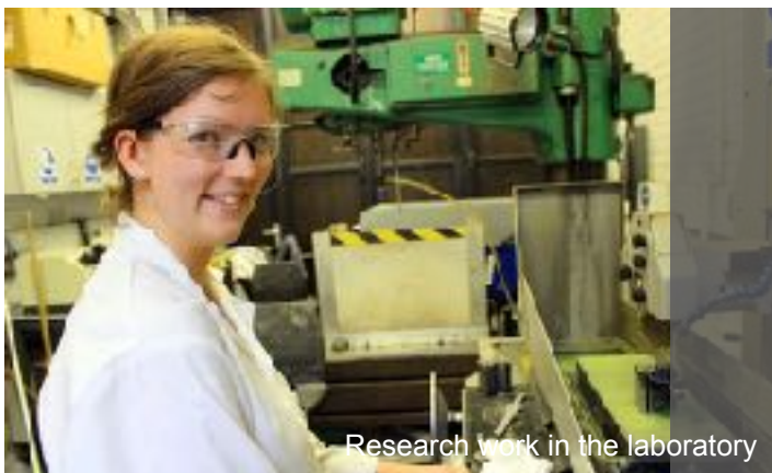
Research work in the laboratory

Assessment is by individual and group presentations, coursework, written examinations and a research project.