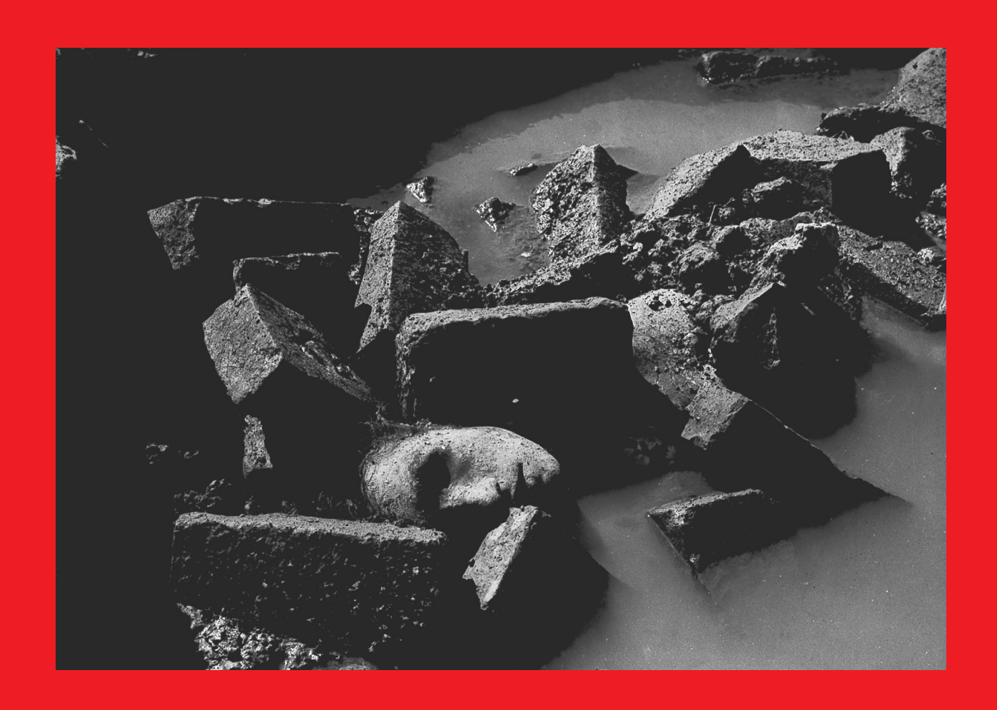
Dismembered head of an intellectual killed on 14 December 1971 at Rayer Bazar, Dhaka.