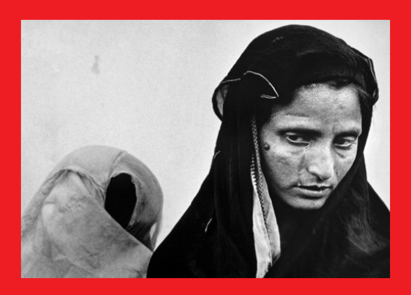
Sexual abuse: Servivor and victim, 1971. Photo: Photographer Kishore Parekh Bangladesh: A Brutal Birth (Hong Kong: Image Photographic Services, 1972).