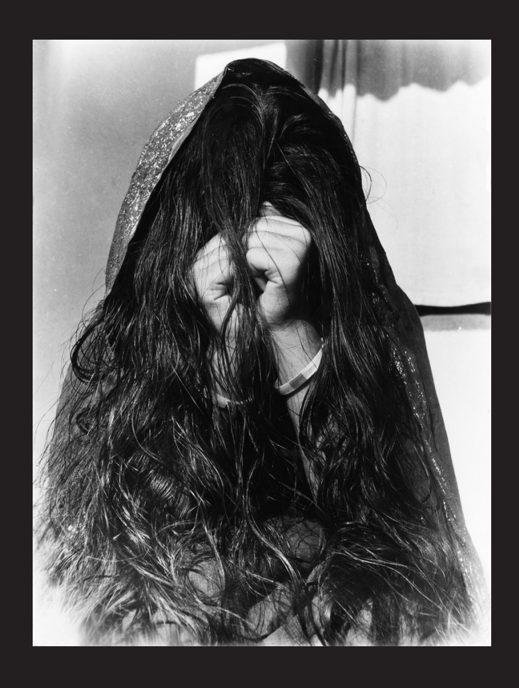
One of the estimated 400,000 birangona (brave women), who were raped during the war, 1971.