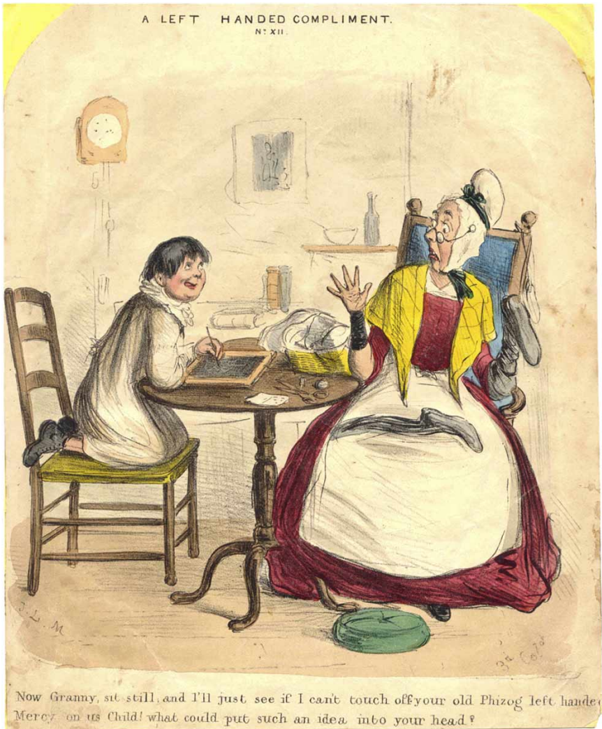
Figure 1. The recto of A Left Handed Compliment by J. Lewis Marks. To view this figure in colour, please visit the online version of this Journal.

In 2006 one of us (JS), at a sale of antique prints and ephemera in London, discovered the print of size 239 mm (height) × 192 mm (width), that is shown in Figure 1. The print is a hand-coloured lithograph, the image and the hand-drawn lettering being typical of that technique (Gascoigne, 2004). Entitled, at the top, “A LEFT HANDED COMPLIMENT./N°. XII”, in the bottom left-hand corner it is signed on the block, “J.L.M.”, and in the bottom right-hand corner, also on the block, is “3 d Col d ” (presumably,