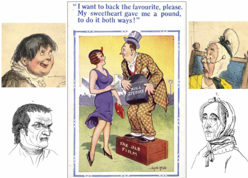
Figure 4. Centre: Post card by Donald McGill (obtained from en.wikipedia.org/wiki/Image:McGill_betting.jpg ), along with (top right and top left) details of the heads from A Left Handed Compliment , showing the similarity in the expressions. Bottom left and right show two of the physiognomic heads from Lavater, which have been left-right reversed from the original to match better the two figures in A Left Handed Compliment . To view this figure in colour, please visit the online version of this Journal.

Dutch domestic works (Solkin, 2008, pp. 37–77), and genre paintings such as David Wilkie’s “The Cut Finger”, Thomas Heaphy’s “The Family Doctress” and James Northcote’s “The Village Doctress” all feature elderly women wearing similar bonnets and, in the case of the latter two paintings, with glasses perched on their noses, of a type which both Seymour and Marks have here satirised.