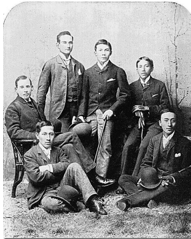
Image 2: A young Lim Boon Keng (seated bottom left), with fellow Queen's Scholars, late-19th century