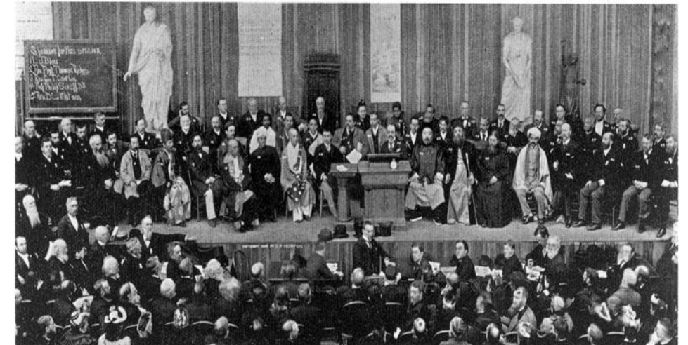
Image 3: The Parliament of Religions 1893, Chicago (at which Vivekananda and Dharmapala argued for the rationality of their reformist versions of Hinduism and Buddhism. The Confucian reformer Tan Teck Soon interviewed Dharmapala in Singapore on the latter's return voyage to Ceylon following the Parliament).