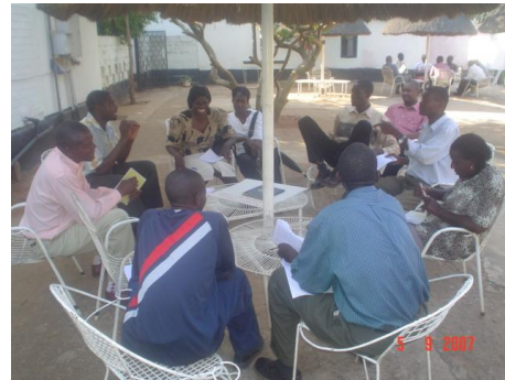
Group work during livelihoods and DRR training for the DTT and CFT, Gwanda District.