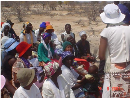
Participatory vulnerability and capacity assessment in session, Madabe Ward.