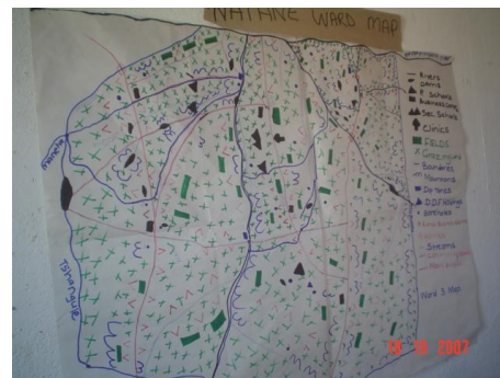
Community hazard risk mapping, Natane Ward, Bulilima District.