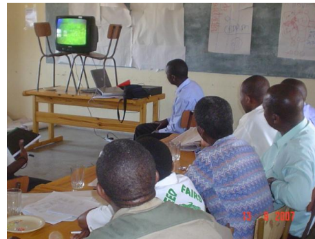
Video case study during Livelihoods and DRR training for DTT and CFT, Mangwe and Bulilima Districts.