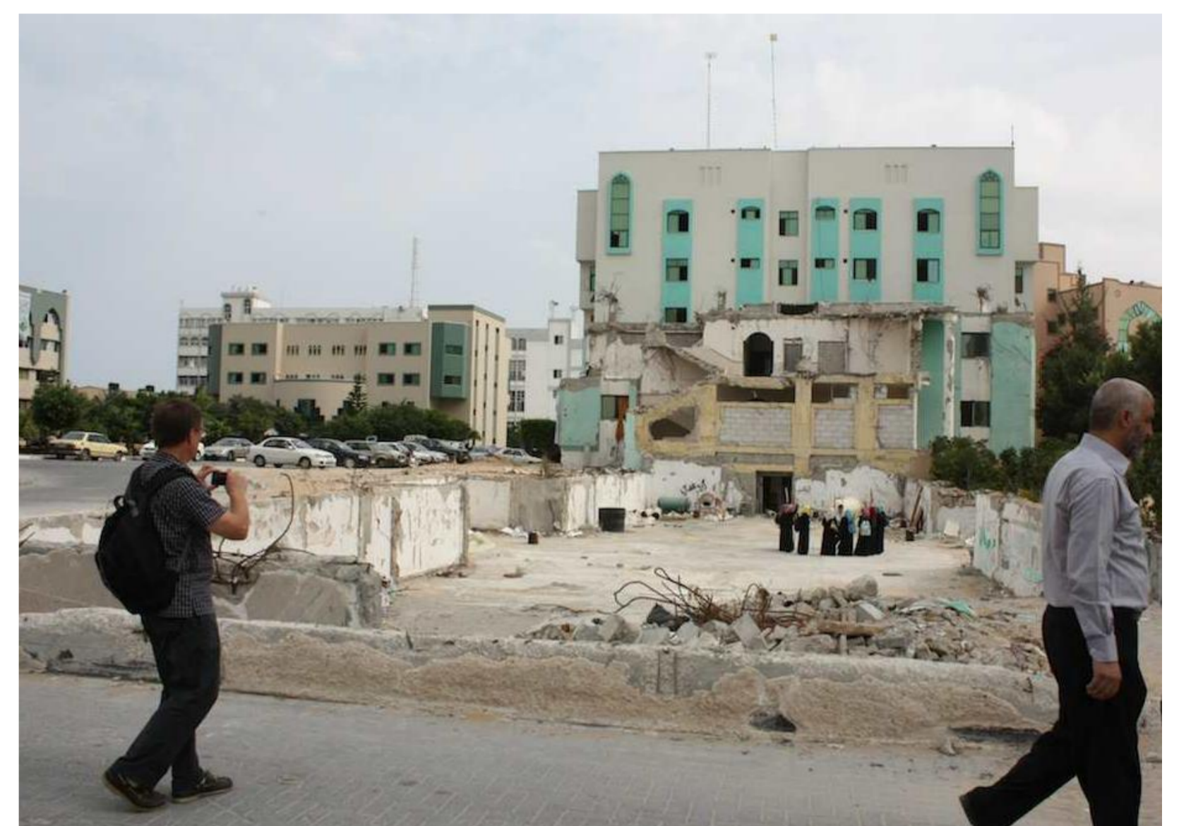
Typical urban landscape in Gaza City