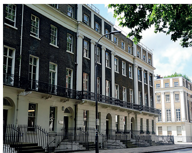
Image above: The GGI is based at the UCL Department of Political Science, 29-31 Tavistock Square.