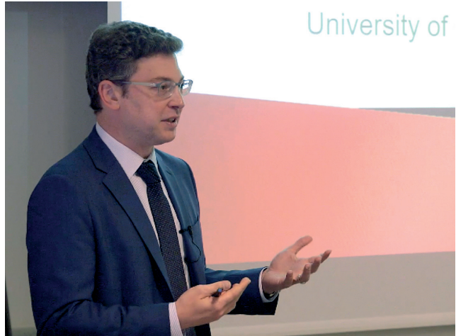
Image right, bottom: This year's Global Governance and Ethics (GGE) student society organised a wide range of activities with support from the GGI.