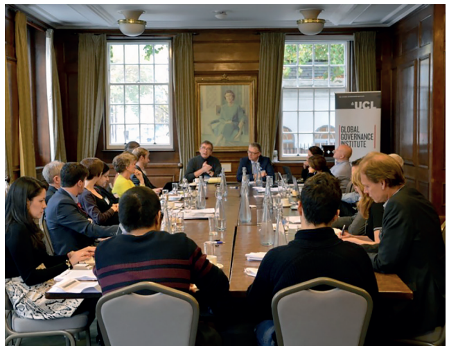
Image below, right: In November 2017, the GGI hosted the inaugural meeting of the ‘UK Network on the Prohibition of Torture’, in collaboration with the UCL Institute of the Americas, UCL Laws and the Centre for Human Rights Law at SOAS.

Image below, left: In June 2018, the GGI hosted a workshop on ‘Innovating Global Public Policy: Cross-Disciplinary Research and Collaboration’, in collaboration with the UCL Global Engagement Office and UCL Public Policy.