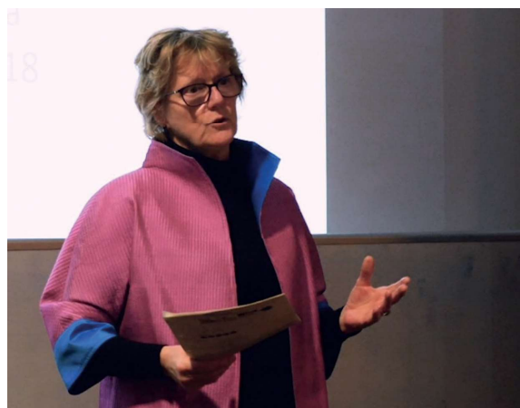
Image above: Professor Dame Sally Davies offered introductory remarks at a keynote lecture on ‘The Need for Global Governance of Antimicrobial Resistance (AMR)’ in December 2019.