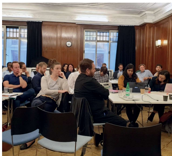
Image above: In June 2019, the GGI co-hosted a workshop on ‘Backsliding on SDG 16? Responding to Shrinking Political and Civic Space around the World’.