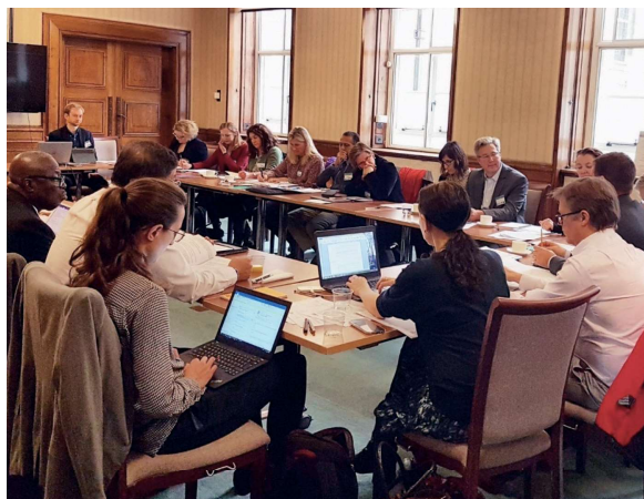
Image above: In December 2018, the GGI co-hosted a workshop on 'Antimicrobial Resistance (AMR): The Role of Regulation'.