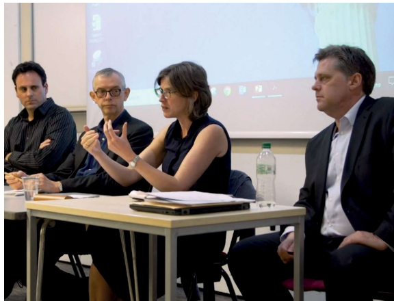
Image above: In May 2019, the GGI hosted a panel discussion on ‘Environmental Justice in a Changing Climate’.