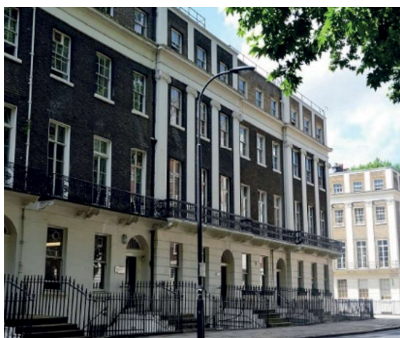
Image above: The GGI is based at the UCL Department of Political Science, 29–31 Tavistock Square.

To respond to these issues, global governance research needs to be ambitious in scope and unafraid of crossing disciplinary and thematic boundaries. The GGI is at the forefront of a new generation of global governance scholarship that draws on a pluralist body of research and theories to explore the full complexities of global public policy making and delivery across different issue areas, with a view to developing a comprehensive understanding of what is causing blockage, contestation and interface conflict and how we might move beyond current impasses. This means taking seriously questions of power, ideology, distributional and value conflict, without losing sight of the fundamental problem-solving imperative of global governance. It also requires researchers to look beyond state-driven, top-down efforts to negotiate ‘global deals’ to discuss the promises, pitfalls, and prospects of organising governance in less formal and less hierarchical ways.