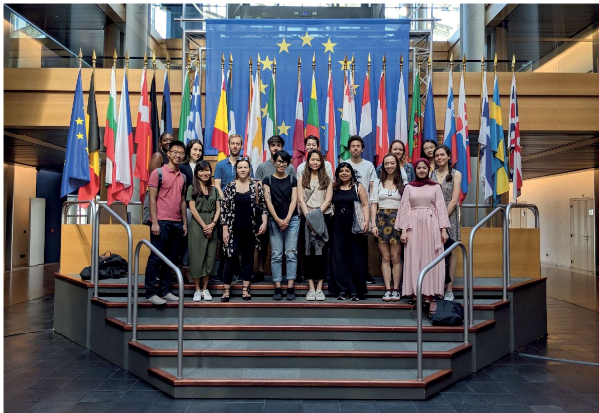
Image above: In June 2019, the GGE Society organised a study trip to Strasbourg, which included a tour of the European Parliament and a visit of the Council of Europe.

As the GGI's profile as a leading centre of cross-disciplinary research, learning, collaboration and policy engagement continues to grow, we look forward to building upon this year's achievements in the months ahead. A key strategic focus for 2019-20 will be to recalibrate and expand the GGI's research agenda, consolidate its internal and external networks and deliver on major research grants. As Professor Acharya noted during his stay at the GGI, global governance is a challenging but also 'a fantastically rich field of study'. With your support, we hope to be at the forefront of truly innovative thinking on global governance, with the ultimate aim of devising global public policy interventions that actually work – and not just for a select few.