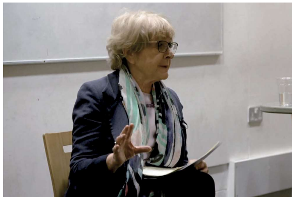
Image above: Dame Margaret Hodge (MP for Barking) at a keynote lecture on 'The Fight against Tax Evasion', co-hosted with the GGE student society in May 2019.