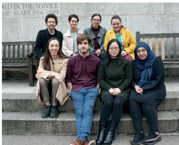
Image above: This year's GGE Society organised a wide range of activities with the support from the GGI.