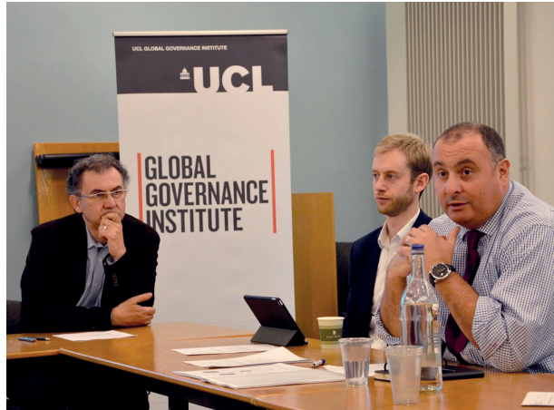
Image above: The inaugural meeting of the International Global Governance Network took place at the GGI in November 2016.