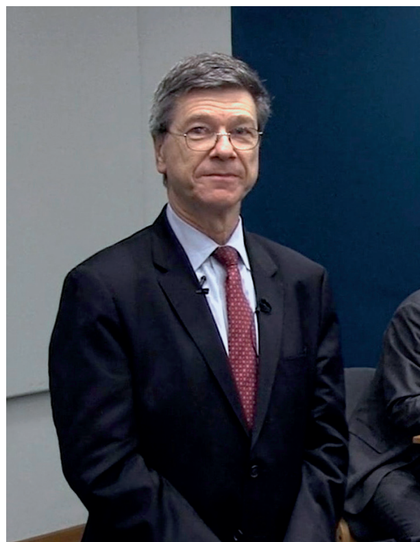
Image below: In February 2017, the GGI hosted Professor Jeffrey D. Sachs, a world-renowned professor of economics and a leading thinker on sustainable development.