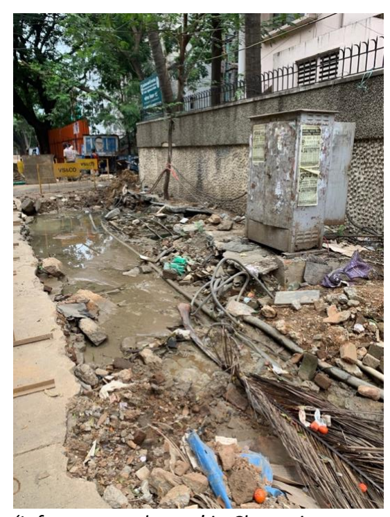
'Infrastructural mess' in Chennai