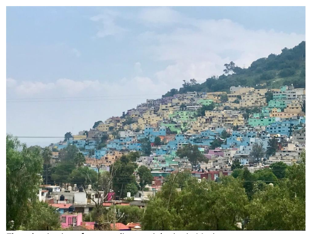
The urbanisation of metropolitan peripheries in Mexico

'Thick time': Experiments with feminist urban futures in community podcasts. Geoforum