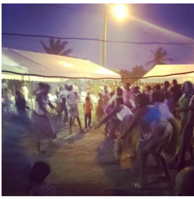
Audiences turn a peace-building show into a ball in Abobo (Abidjan north)

His piece <u>Post-Conflict Soundings: Noise and voice in Abidjan</u> was published by Theatrum Mundi .