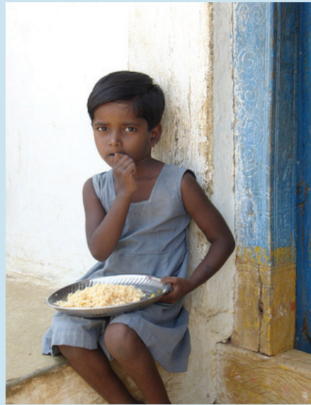
Above: Lunch-time rice, Hyderabad, India.