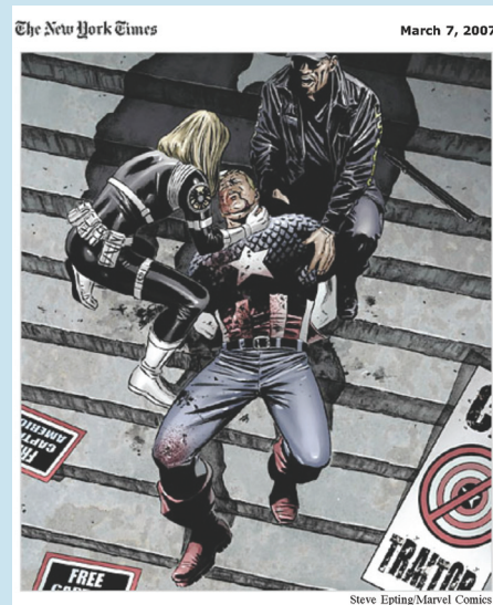
The New York Times , 7 March, 2007.

indicative of the impact of President Bush's policies on the mythology of America – indeed the subsequent storyline was called "Death of the Dream."