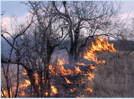
A controlled fire at one of the experimental burn plots.

Philip Lewis and Mat Disney headed a field expedition in October 2008, to monitor carbon release from fires in Kruger National Park, South Africa. The team monitored controlled fires to develop ways of mapping fire occurrence and severity from space, and predict how much carbon is released into the atmosphere. Fire is a key component of the terrestrial carbon and climate cycle, although its effects are currently quite poorly understood.