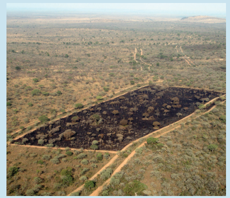
Helicopter view of the impact of the fire and the surrounding bush.

Philip Lewis and Mat Disney headed a field expedition in October 2008, to monitor carbon release from fires in Kruger National Park, South Africa. The team monitored controlled fires to develop ways of mapping fire occurrence and severity from space, and predict how much carbon is released into the atmosphere. Fire is a key component of the terrestrial carbon and climate cycle, although its effects are currently quite poorly understood.