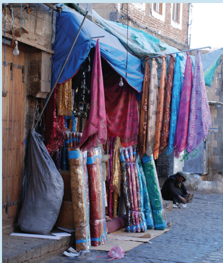
Dress shop, Souk, Sana'a.

for Scientific Research on a GIS-based School Atlas and spatial decision support systems for school planning.