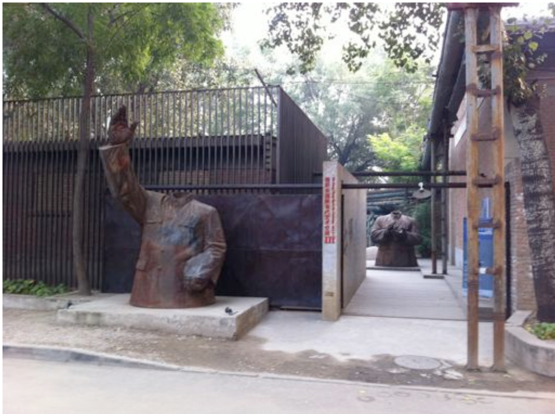
Reworking Maoist symbols, 798