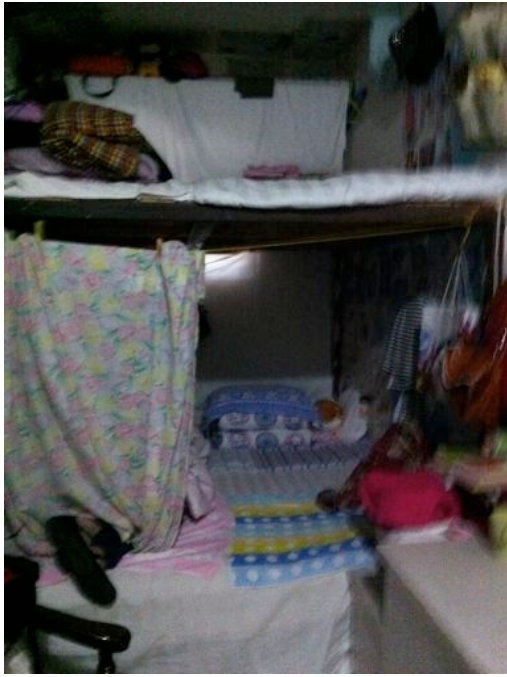
Room in a private Chinese house in Nanjing