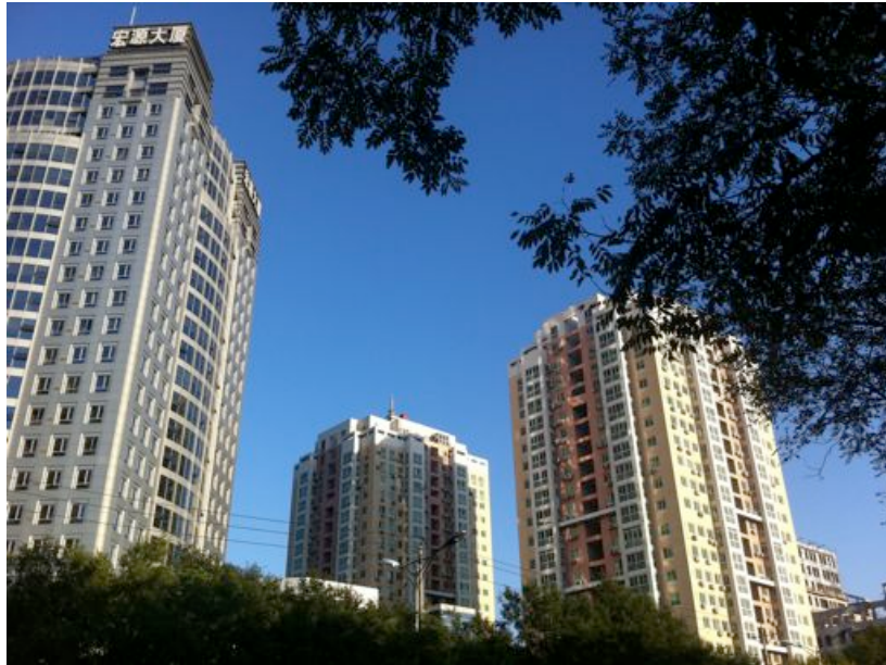
My residential neighbourhood in Beijing