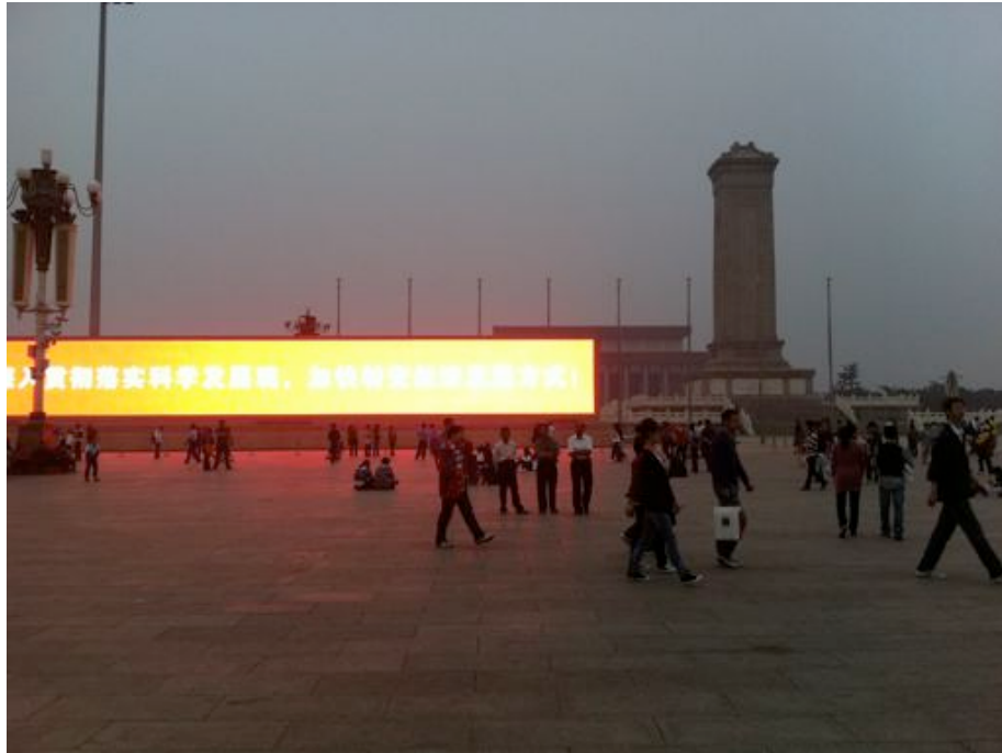
Tian'an Men Square