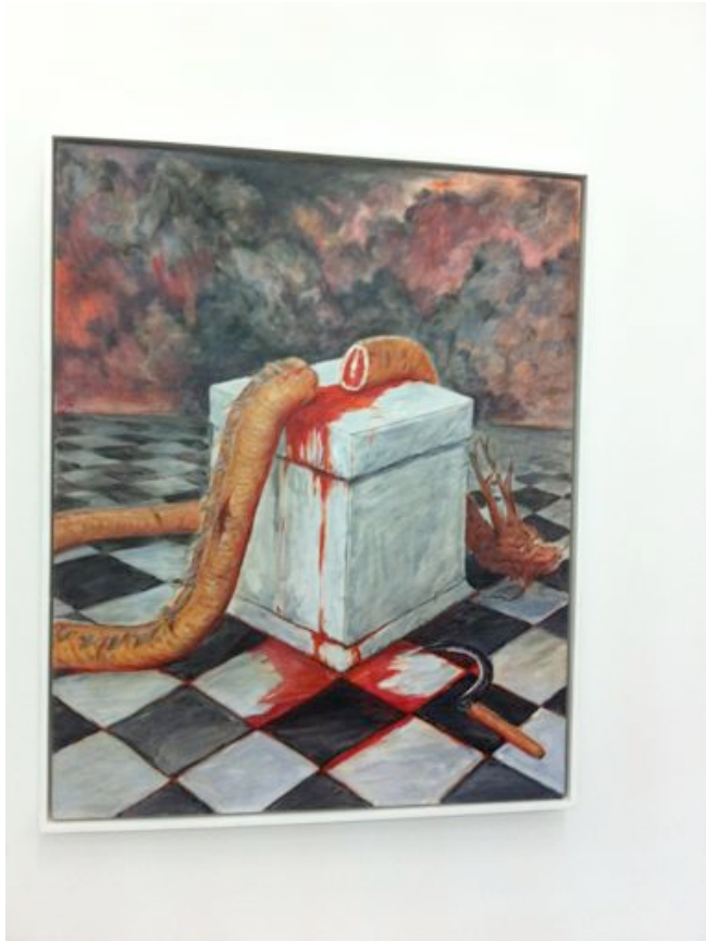
Political, anti-communist art, Caochangdi art district