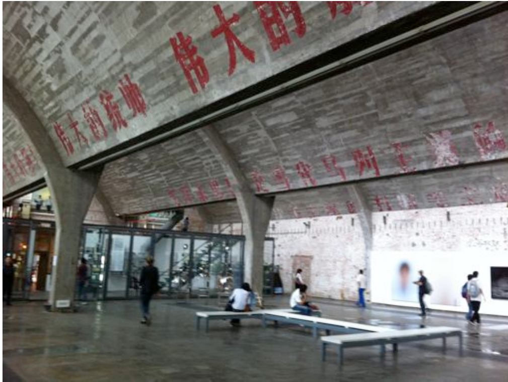
Photography gallery in 798 with slogans worshipping Mao on the ceiling