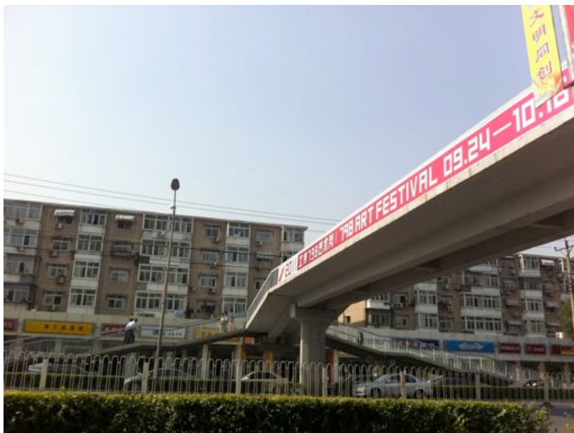
798 Art District