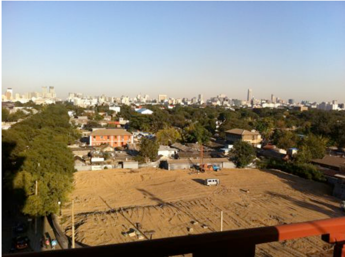
View of Beijing suburbs