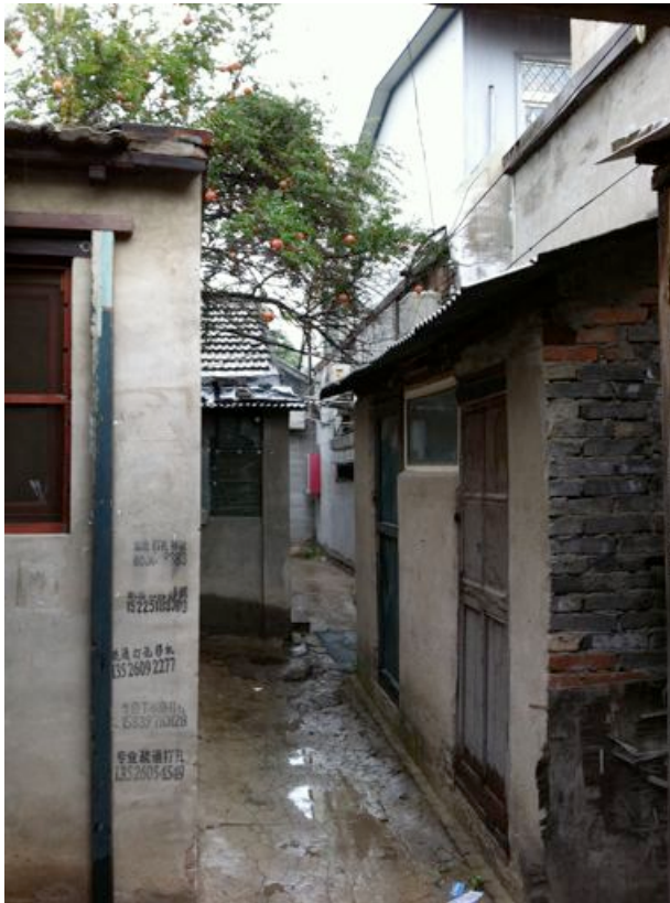
Hutong in Nanjing