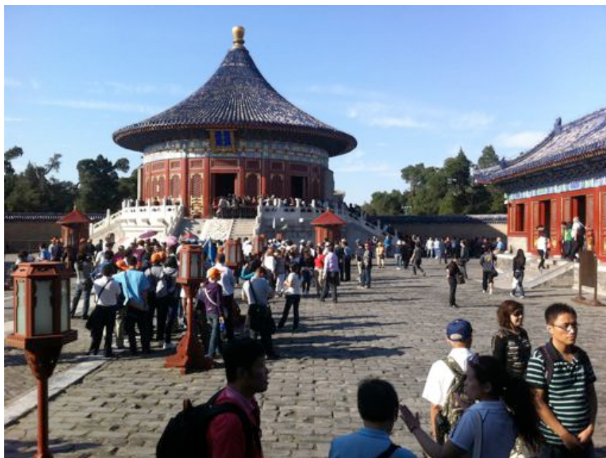
Temple of Heaven