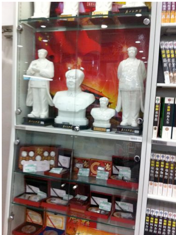
Mao Zedong figurines in a local bookshop