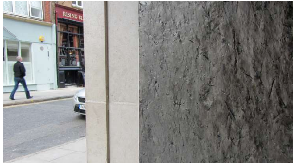
Where? Metropolis House, service and utilities entrances on Windmill Street.