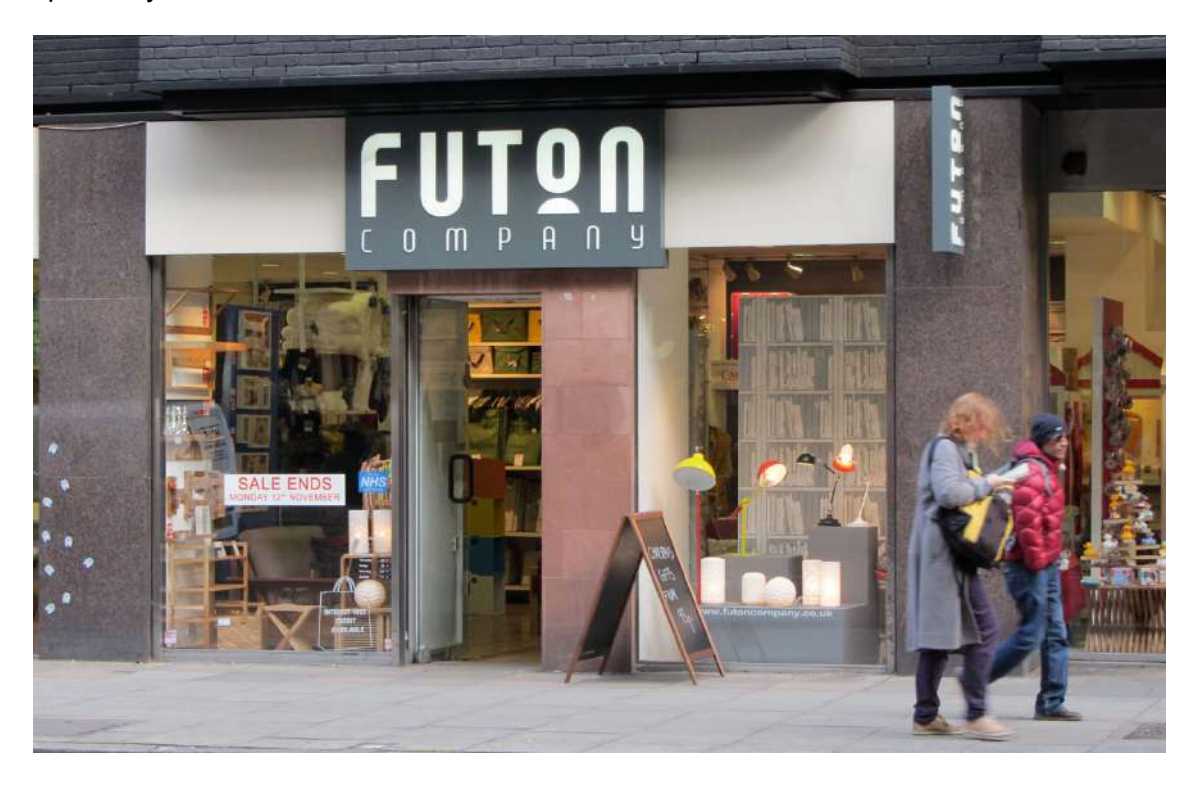
Just after The Futon Company's store, turn left into the passage leading from Tottenham Court Road to Mortimer Market.

The row of shops between University Street and the passageway to Mortimer Market are predominantly faced with multi-coloured Dakota Mahogany Granite, one of the most ancient rocks on Tottenham Court Road at 2.7 Ga, it comes from South Dakota in the North American Craton. An exception to this façade is the right hand doorpost of The Futon Company which is constructed of red, probably Permian, sandstone.