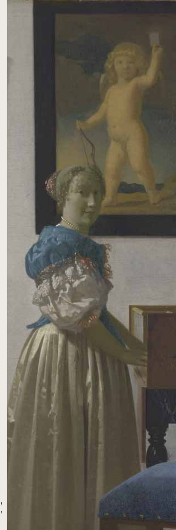
Johannes Vermeer, A Young Woman Standing at a Virginal (c. 1670–72)

The donor will also be honoured at UCL through a special inaugural event, announcement of the gift to international media, and membership of the Chair of Council's Circle.