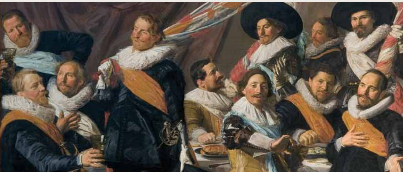
Frans Hals, Banquet of the Officers of the St. George Civic Guard (1624-27), photo © Margareta Svensson, courtesy the Frans Hals Museum, Haarlem

The Committee for Low Countries Studies in London co-ordinates activity and facilitates the exchange of information between individuals active in Low Countries studies in London. It is composed of leading scholars plus representatives of the Royal Netherlands Embassy, the Embassy of Belgium in London, and Flanders House, which represents the Flemish Government. It is overseen by an Advisory Board.