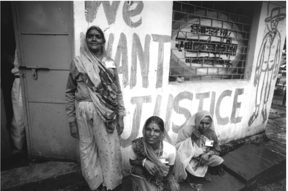
Women from the survivors' organization (Gas Peedit Mahila Stationery Karmachari Sangh) on the 15th anniversary of the Bhopal accident.