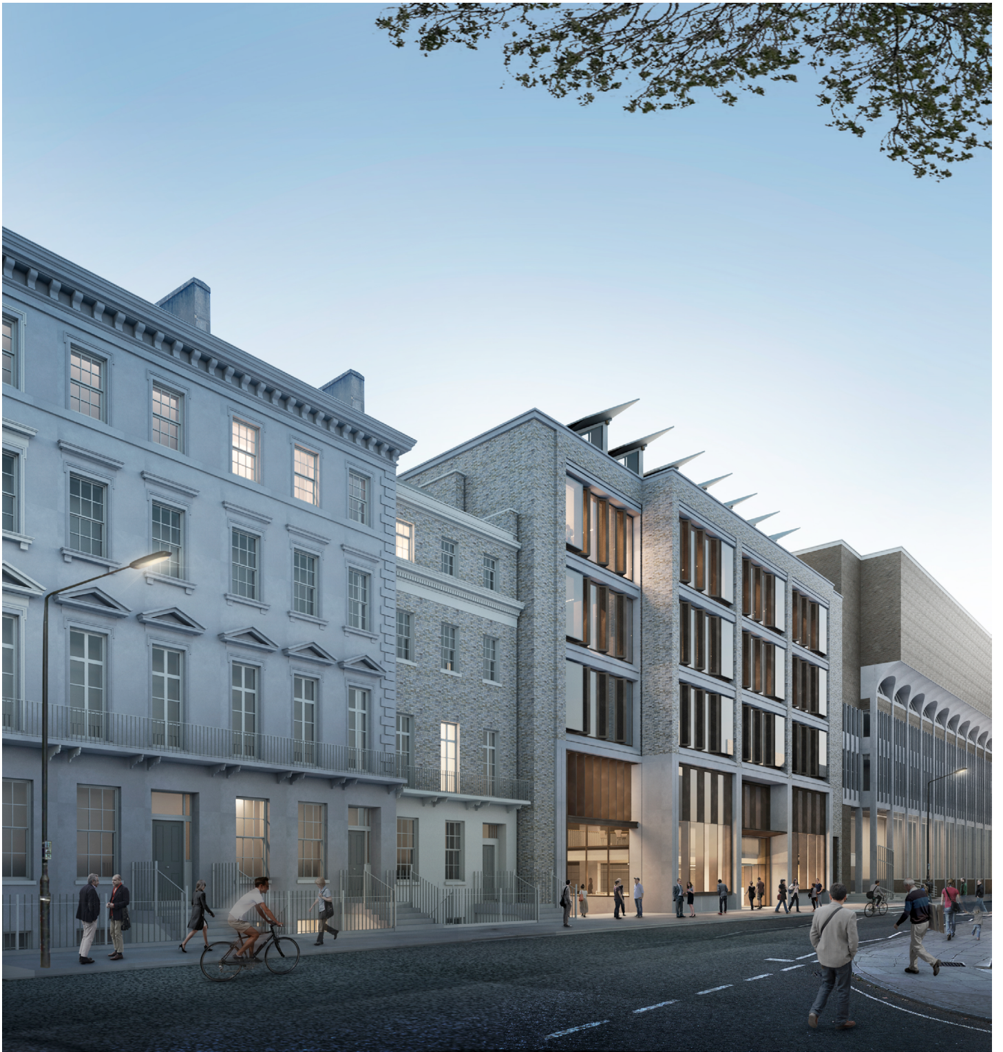
Gordon Street Facade