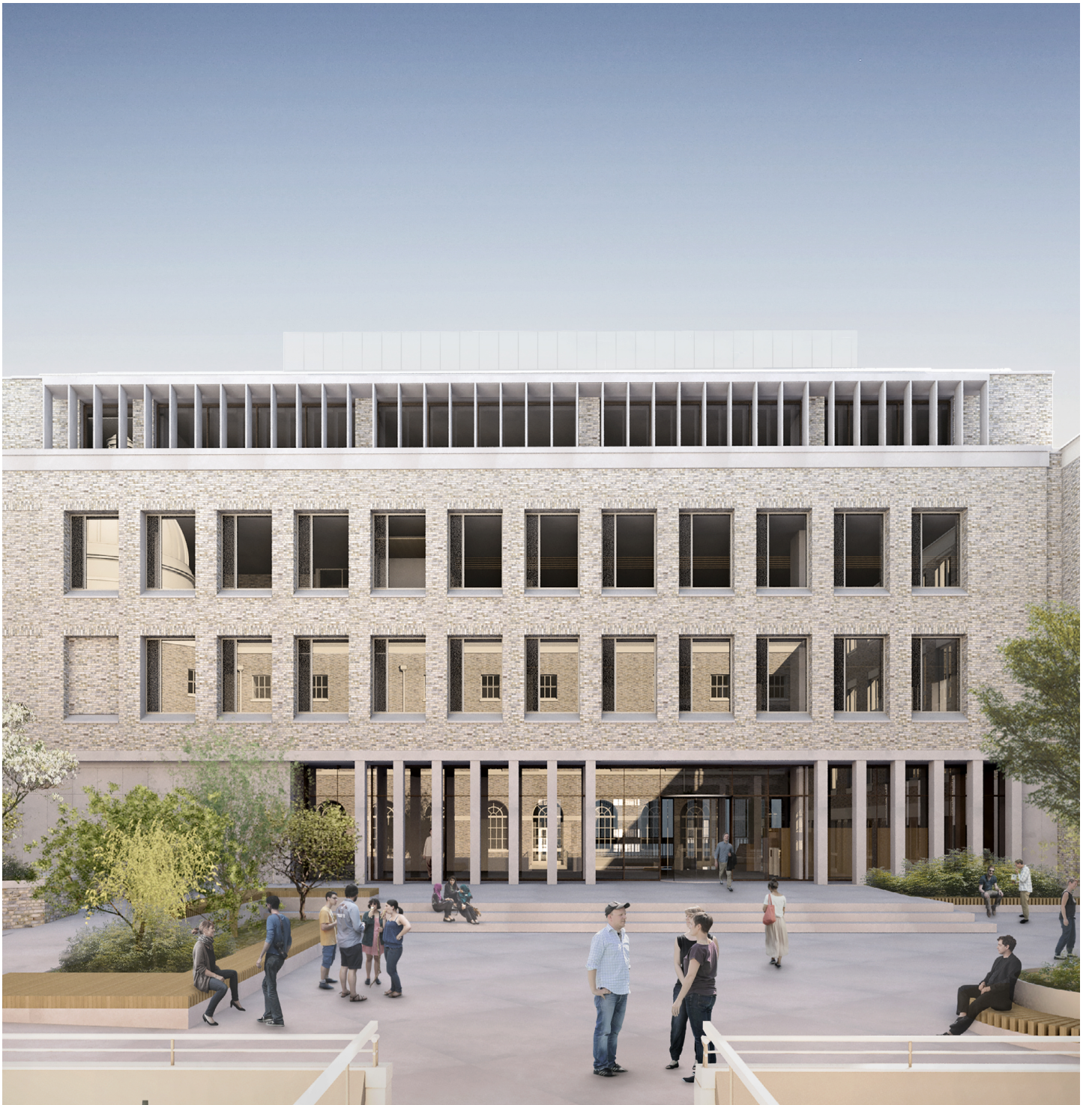
View from Japanese Garden