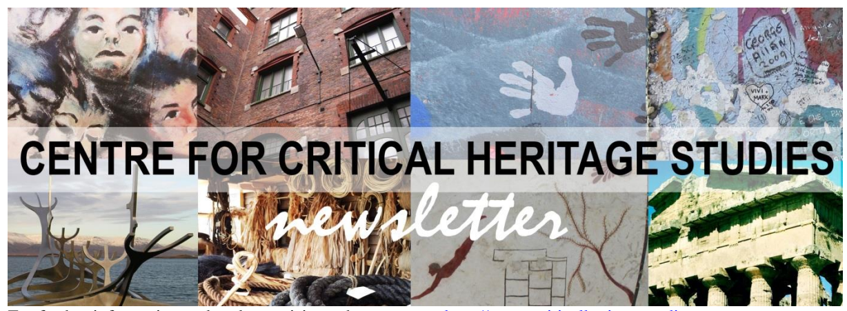
For further information and updates, visit our homepage at http://www.criticalheritagestudies.gu.se