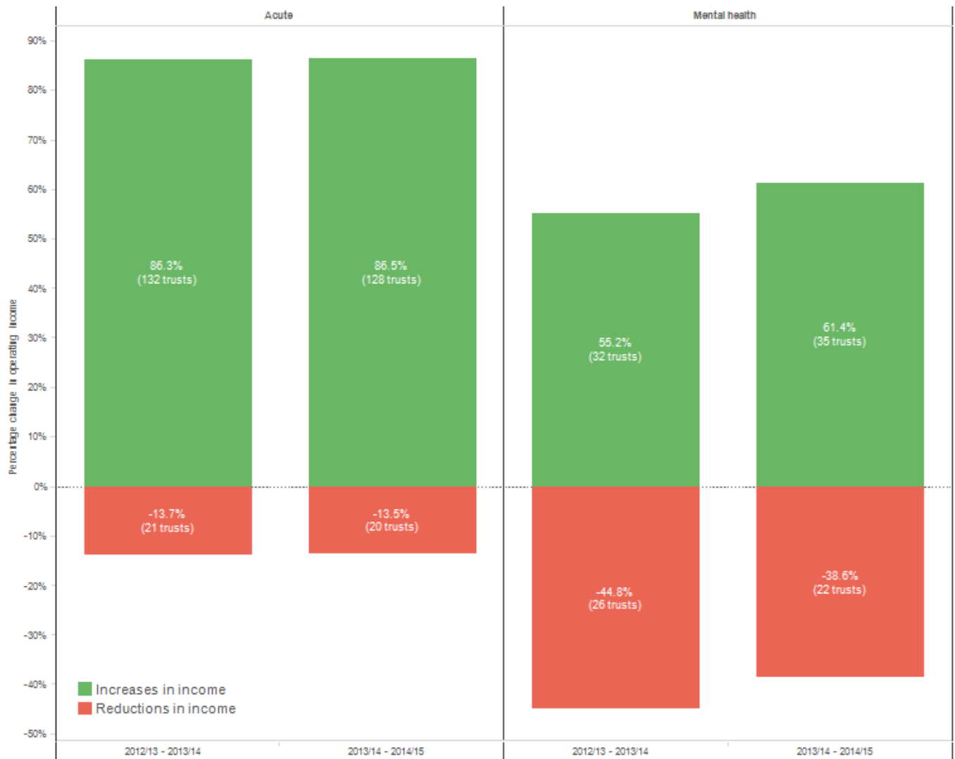
Figure 1 Percentage change in operating income for acute and mental health trusts