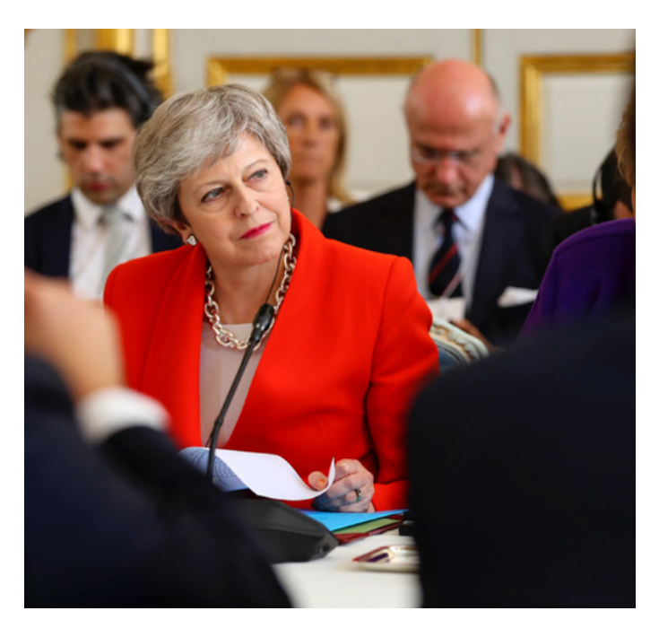
Theresa May at the Online Harms Summit in Paris

While the broad thrust of the report was widely welcomed, many – including the chair of the Commons DCMS Committee, <u>Damian Collins</u>, and Labour's DCMS Shadow Secretary of State, <u>Tom Watson</u> – criticised its lack of specific action on political advertising. In May, however, the Cabinet Office <u>announced</u> a commitment to introducing a requirement for online political advertising to carry an imprint specifying its source. It promised to publish detailed proposals later in the year.