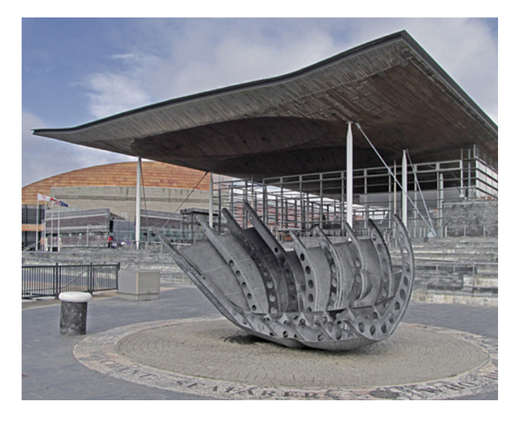
Welsh National Assembly by Andrew Gustar (CC BY-ND 2.0).

In the Assembly, major legislative reforms are well underway. The Legislation (Wales) Bill has proceeded to the third stage of the legislative process after the Constitutional and Legislative Affairs Committee (CLAC) reported in favour of its general principles in March. The bill was amended during the second stage of the legislative process and will now proceed to consideration in plenary. If passed, it will require the Welsh government to bring forward plans for the codification of Welsh law.