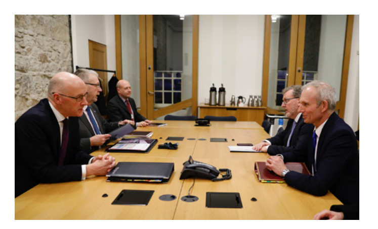
Scottish and UK ministers discuss Brexit, by Scottish Government (CC BY-NC 2.0).

Although there is already government training on devolution, the committee was 'alarmed' that only a third of civil servants reportedly believed they had a good understanding of the subject. It therefore recommended a review of the training regime and greater use of secondment and exchange of officials between governments.