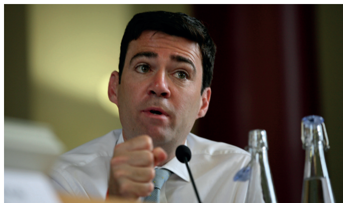
The new Mayor of Greater Manchester, Andy Burnham.

The 2017 Budget announced no new devolution deals, but it did launch a strategic approach to the 'Midlands Engine', a pan-regional economic strategy paralleling the 'Northern Powerhouse'. Some additional discussions with the Greater London Authority are ongoing, but have been delayed by the general election.