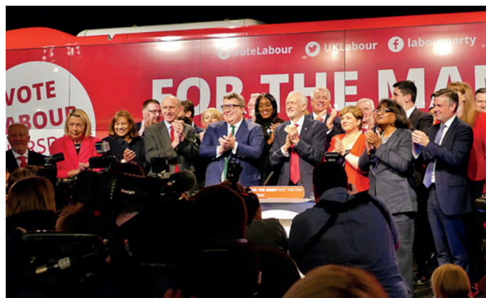
The Labour Party's campaign launch.

Several factors contributed to these shifts. Theresa May's weakness as a campaigner combined with the unpopular Conservative manifesto and subsequent u-turn over social care to destroy the core message of 'strong and stable leadership'. Jeremy Corbyn, meanwhile, transformed from a tetchy to a confident media performer, while his radicalism and seeming authenticity mobilised young voters to an exceptional degree. Monitor readers are likely to find more systemic factors of particular interest. Initial evidence suggests that the rise of social media may have allowed left-wing websites to challenge the traditional right-leaning press, particularly among the young. Highly targeted online advertising seems to have grown substantially. As discussed below, concerns that such advertising is both opaque and insufficiently regulated are growing, and pressure for reform is likely to rise.