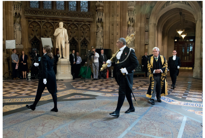
Re-elected Commons speaker John Bercow processes through Central Lobby, 21 June 2017.

The elections for select committee chairs are likely to take place shortly before the summer recess, which starts on 21 July. As a consequence of the election result only a minority of committee chairs will be allocated to the Conservatives , with the remainder split between opposition parties.