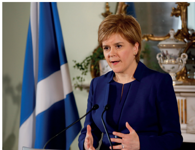
First Minister Nicola Sturgeon speaks following the general election results.