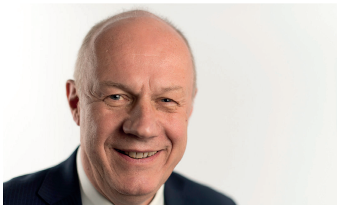
Damian Green, who was promoted to First Secretary of State and Minister for the Cabinet Office following the general election.

The unexpected election outcome resulted in unusually high post-election continuity in government, at least in terms of ministerial posts (see page 15 for changes). The Cabinet Office had properly prepared for all contingencies, including a hung parliament, by convening a meeting of constitutional experts before the election to check that the procedures laid down in the Cabinet Manual were still correct. They will have been less well prepared for their Cabinet Office Minister Ben Gummer losing his seat, and being replaced by Damian Green, now also promoted to First Secretary of State. This, together with the resignations of the Prime Minister's chiefs of staff, Nick Timothy and Fiona Hill, created expectations of changes in the operation of the centre of government.