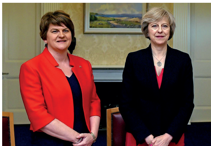
Prime Minister Theresa May meets DUP leader Arlene Foster.

The confidence and supply agreement between the Conservatives and the DUP was signed by the parties' respective chief whips on 26 June. The agreement commits the DUP's 10 MPs to supporting the government on 'motions of confidence; and on the Queen's speech; the Budget; finance bills; money bills;