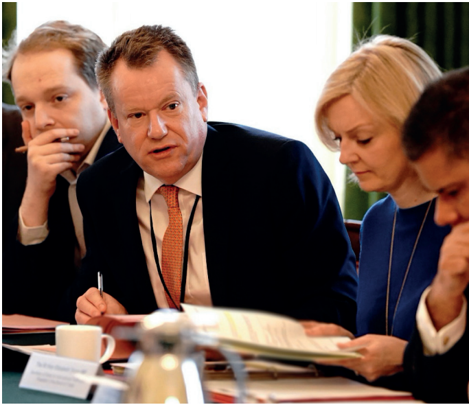
The UK's chief Brexit negotiator, David Frost

agreeing the terms of a complex new relationship in such a short time frame was already immensely difficult; the pandemic has made it seem almost impossible.