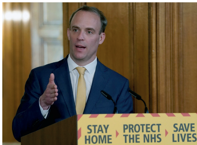
Dominic Raab fills in for the Prime Minister during his illness (CC BY-NC-ND 2.0) by UK Prime Minister.

Coronavirus has arguably tested the government more severely than any crisis since the Second World War. An Institute for Government reunion of former Cabinet Secretaries agreed that it is far bigger than any crisis which they had to handle. A new and inexperienced Prime Minister has had to deal with three crises at once: the COVID-19 pandemic; its drastic consequences for business, the economy and the public finances; and preparing for Brexit and the possibility of 'no deal' (see pages 2–3). On top of this the Prime Minister was seriously ill for a month, leaving the government in the hands of the (equally inexperienced) Foreign Secretary Dominic Raab, with speculation about the extent of his authority, and about what would happen if Johnson failed to recover. Health Secretary Matt Hancock, Cabinet Secretary Mark Sedwill and the PM's Chief of Staff Dominic Cummings also contracted the virus (or were suspected to have done so), restricting their effectiveness at a critical time.