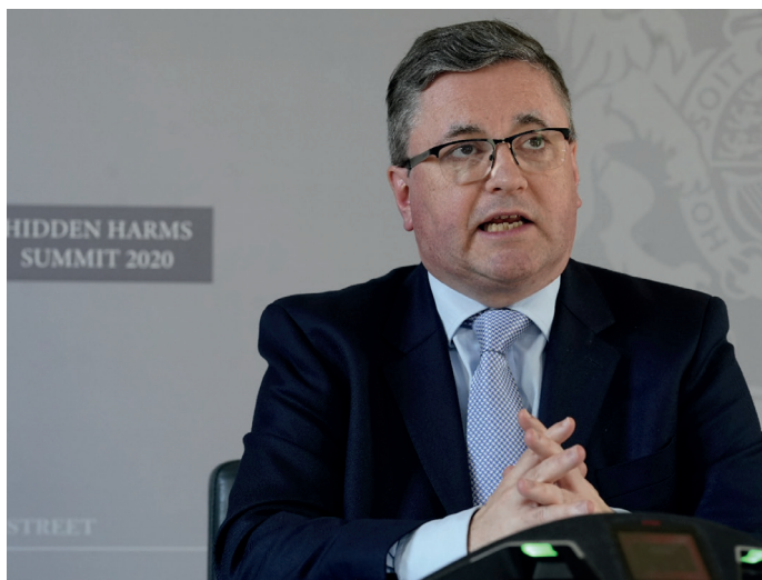
Lord Chancellor Robert Buckland

Many parts of the court system were facing a huge backlog of cases before the lockdown. The pandemic made this even worse, especially in the criminal courts and employment tribunals , prompting reports that the government is considering reintroducing court fees for the latter. The process of reopening courts commenced in April and has continued steadily since then. However, the need for social distancing means that remote hearings and the use of alternative premises will be required for some time yet.