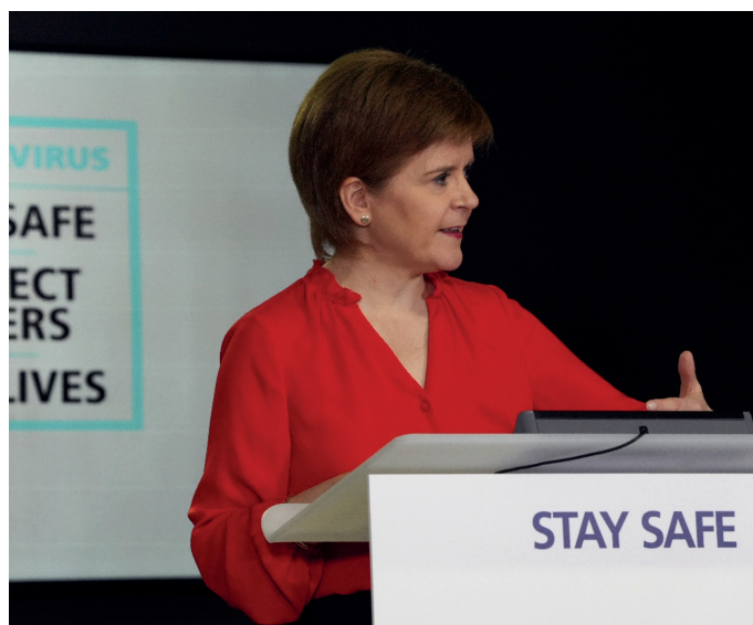
Scottish First Minister Nicola Sturgeon

which holds the macroeconomic and day-to-day levers needed to right the economy. Despite the drift away from intergovernmental cooperation (see pages 16–17), there is therefore a continued need for such an approach. However, relations over Brexit remain problematic , and tensions about the UK government's handling of this new crisis have damaged an already strained relationship.