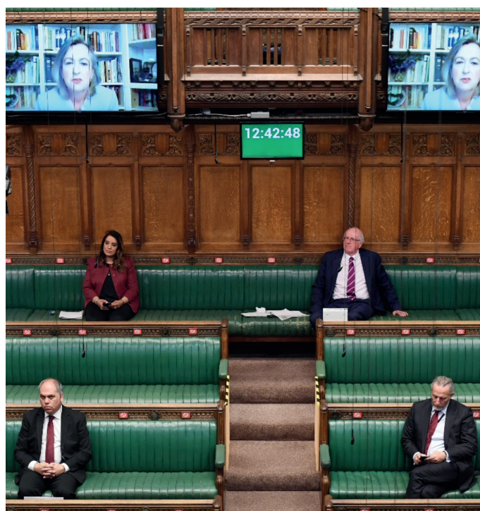
First virtual PMQs (CC BY-NC 2.0) by UK Parliament.