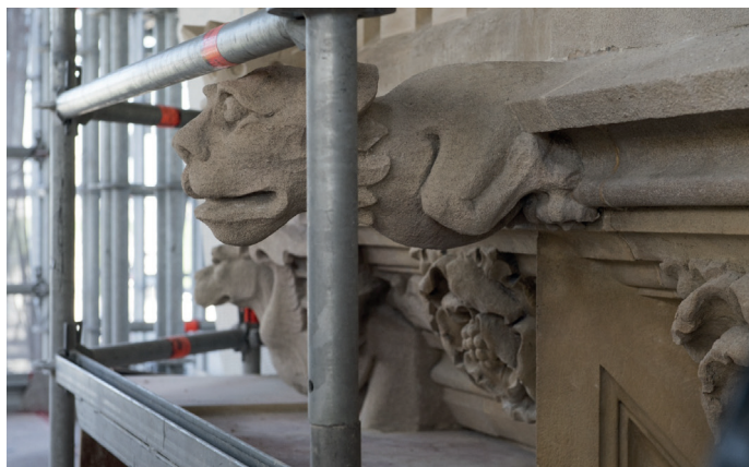
A 'grotesque' cleaned as part of the Restoration and Renewal project (CC BY-NC 2.0) by UK Parliament.

On 8 April, responsibility for the Restoration and Renewal (R&R) of the Palace of Westminster transferred from the parliamentary authorities to the Parliamentary Works Sponsor Body. This milestone, six months after royal assent was granted for the governance legislation, makes the Sponsor Body the single R&R client; it will oversee the completion of the work by a delivery authority.