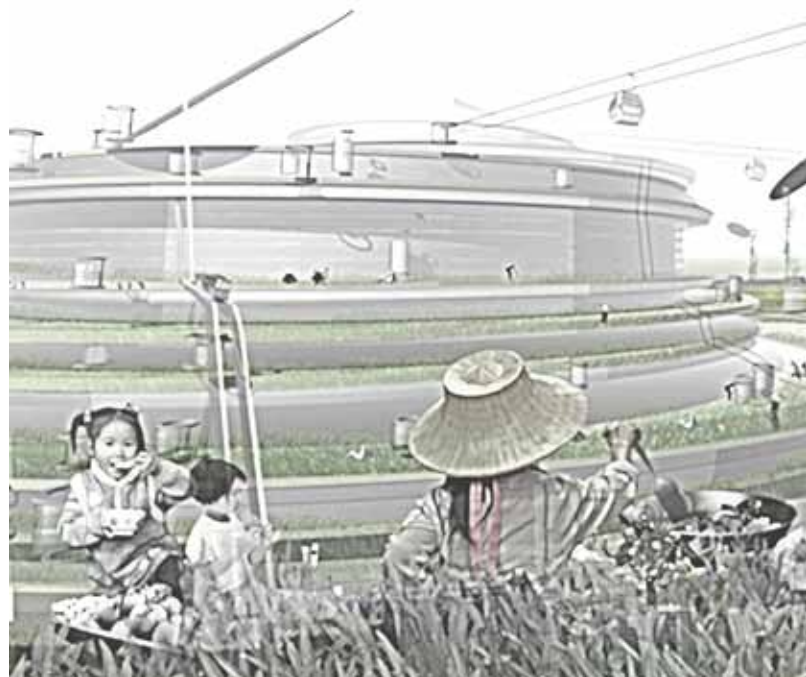
Perspective vertical kitchen garden farms for socialising and in between spaces creating fields for livestock.

Intended for non-Chinese speakers, the programme will provide a foundation in the language, history and culture of China, with specialist courses in different aspects of China's health and her impact around the world. Language will be taught at beginner, intermediate and advanced level. Options will also include a summer programme in language and/or health studies in China. Apart from the compulsory courses a wide range of options are available for students to design their own programme (for more information about course structure and options visit www.ucl.ac.uk/chinahealth ).