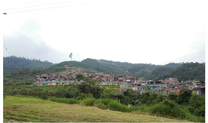
Barrio Samaria