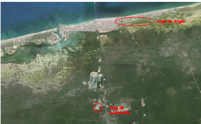
New Housing in Campestre Flamboyanes.