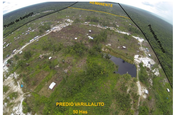
Layout and buildings for New Belen resettlement project