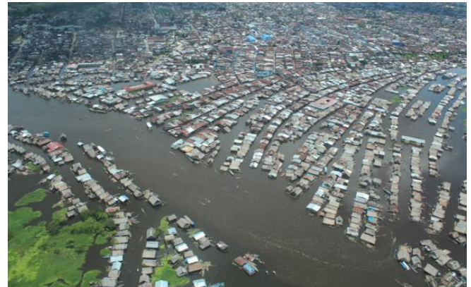
Relocation site at Varillalito, district of San Juan Bautista.