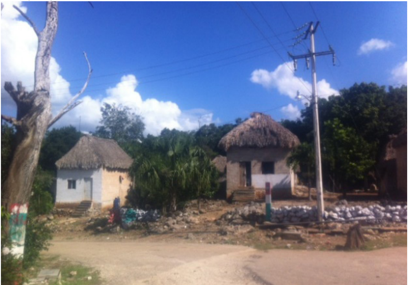
Housing in Tigre Grande Resettlement.

with the passing of Hurricane Isidore. Flooding of up to 10 metres occurred that lasted for more than two months and materialized a week after the passing of the hurricane. No one has an adequate explanation of the origins of the flood waters as such. Comprising 34 and 31 dwellings and families respectively, the relocation took place to areas very proximate to the original sites and was finalized in 2004, two years after the event, during which time the population occupied temporary shelters. The population are migrant farmers and also cultivate subsistence crops and earn a meagre income from monies given for the maintenance of environmental services associated with their 40 ha agricultural and woodland plots. The Institute for the Development of Mayan Culture (INDEMAYA) headed the scheme with funds from the French government and Carrefour, a French retail company, that were channeled through an NGO dedicated to attending indigenous children. The NGO was headed by Ofelia Medina, a famous Mexican actress. The scheme was designed by her brother Fernando Medina.