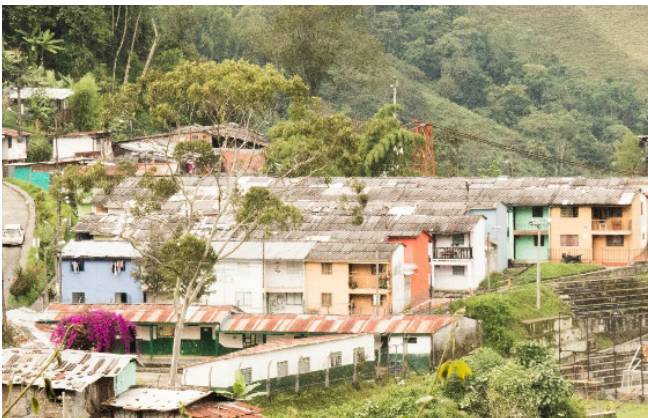
Location of Barrio Paraíso

Barrio Holanda today