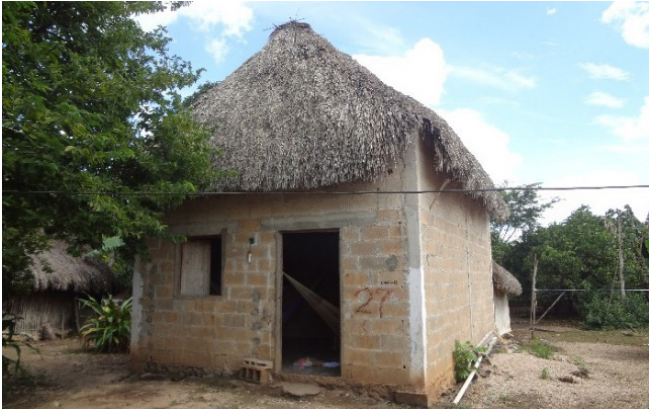
Resettlement housing in El Escondido.

Campestre Flamboyanes, Progreso, Yucatán. This led to the resettlement of 321 families, 8 kilometers from their original flood prone site located