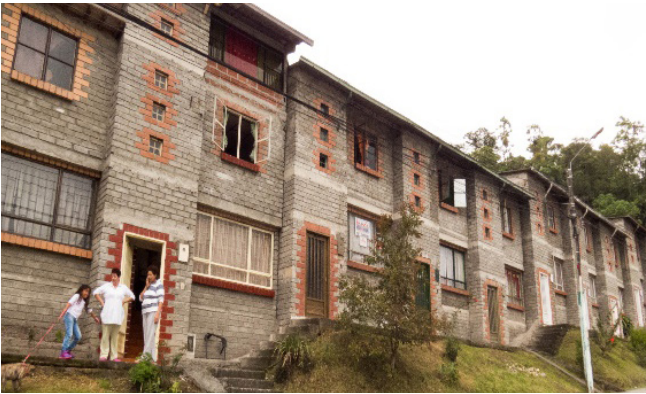
Barrio Yarumales