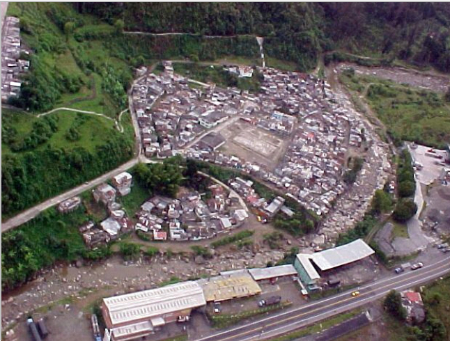
La Playita: prior to resettlement