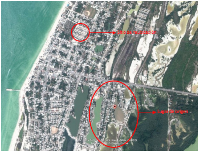
FONDEN: Original and new location.