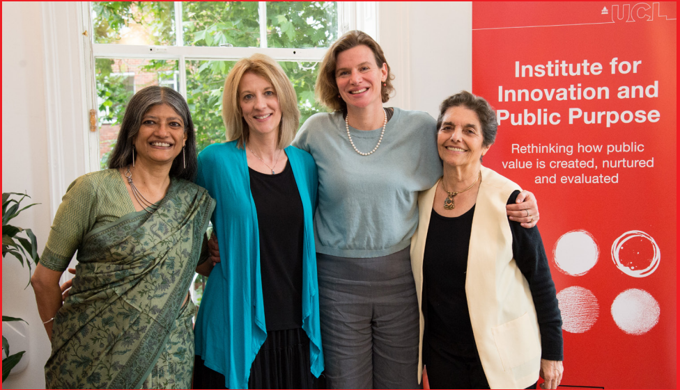
Advisory Board members Jayati Ghosh, Stephanie Kelton and Carlota Perez with Director Mariana Mazzucato

The world is facing pressing challenges — social, technological and economic. What is the future of the welfare state? How can digital platforms be governed in democratic and inclusive ways? What new forms of investment, regulation and collaboration can best tackle global warming?