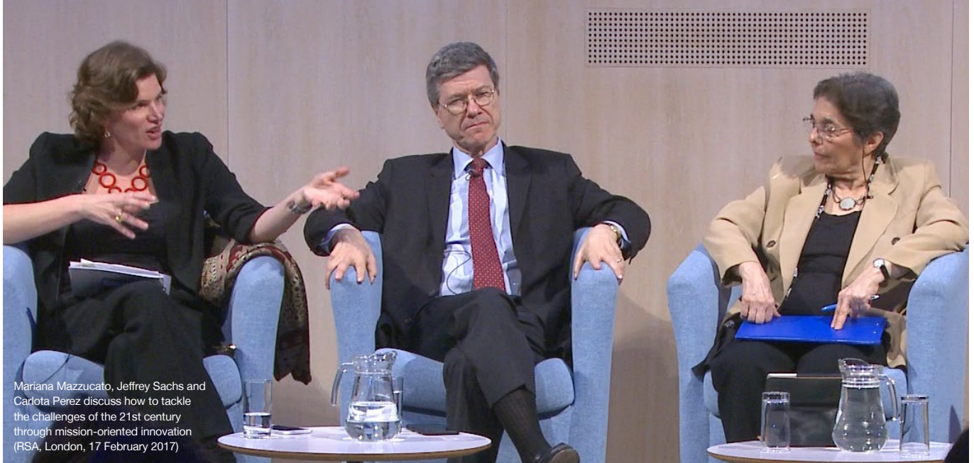
Mariana Mazzucato, Jeffrey Sachs and Carlota Perez discuss how to tackle the challenges of the 21st century through mission-oriented innovation (RSA, London, 17 February 2017)