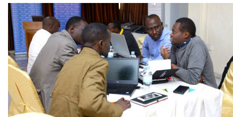
UN FAO - Rwandan technical experts and policymakers from various government departments during the IIPP applied learning programme to support the Ministry of Agriculture and Animal Resources in the transformation of food systems.