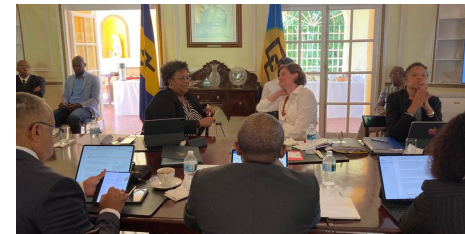
Government of Barbados - Professor Mariana Mazzucato and IIPP's staff creating the applied learning programme framework with Prime Minister of Barbados Mia Mottley and other government representatives to support a mission-oriented economic growth path for Barbados.

So far, we've created cutting edge and innovative applied learning programmes together with: