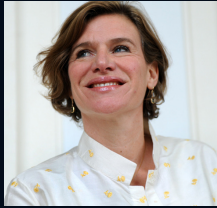
Mariana Mazzucato Founding Director and Professor in the Economics of Innovation and Public Value

Our faculty sets the vision and the direction for our journey at IIPP, and is made up of world-leading academics, policy leaders and cutting-edge innovators and practitioners, including these, teaching in our applied learning programmes: