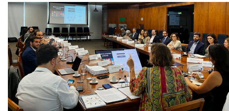
National School of Government, Brazil (ENAP) - As part of IIPP's overarching partnership with ENAP, Professor Mazzucato and the whole faculty have crafted an applied learning curriculum for senior civil servants throughout Brazil, to help them benefit from IIPP thinking as they work on creating Missions and other instruments to spur sustainable growth.