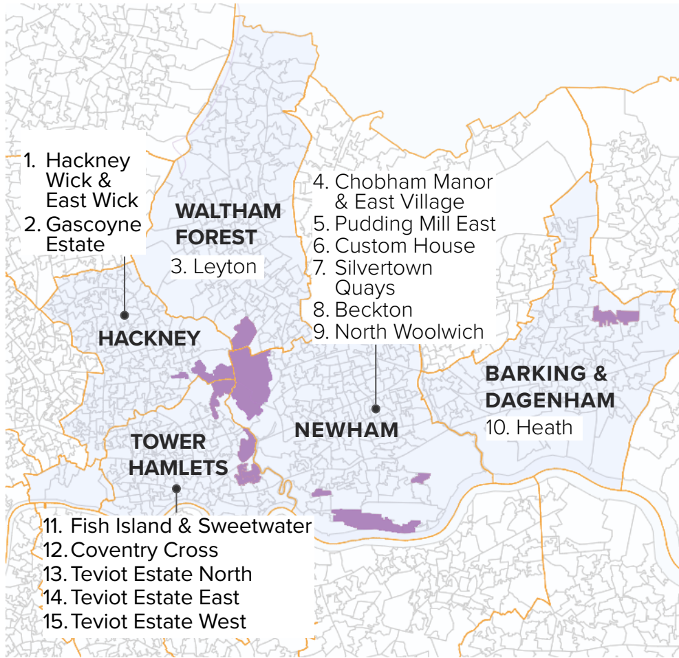
Image 1: map of Prosperity in east London 2021-2031 research sites

These areas are also important sites of rapid socio-economic change, having experienced de-industrialisation and population loss, followed by regeneration, economic transformation, re-population and demographic change within the span of a few decades.