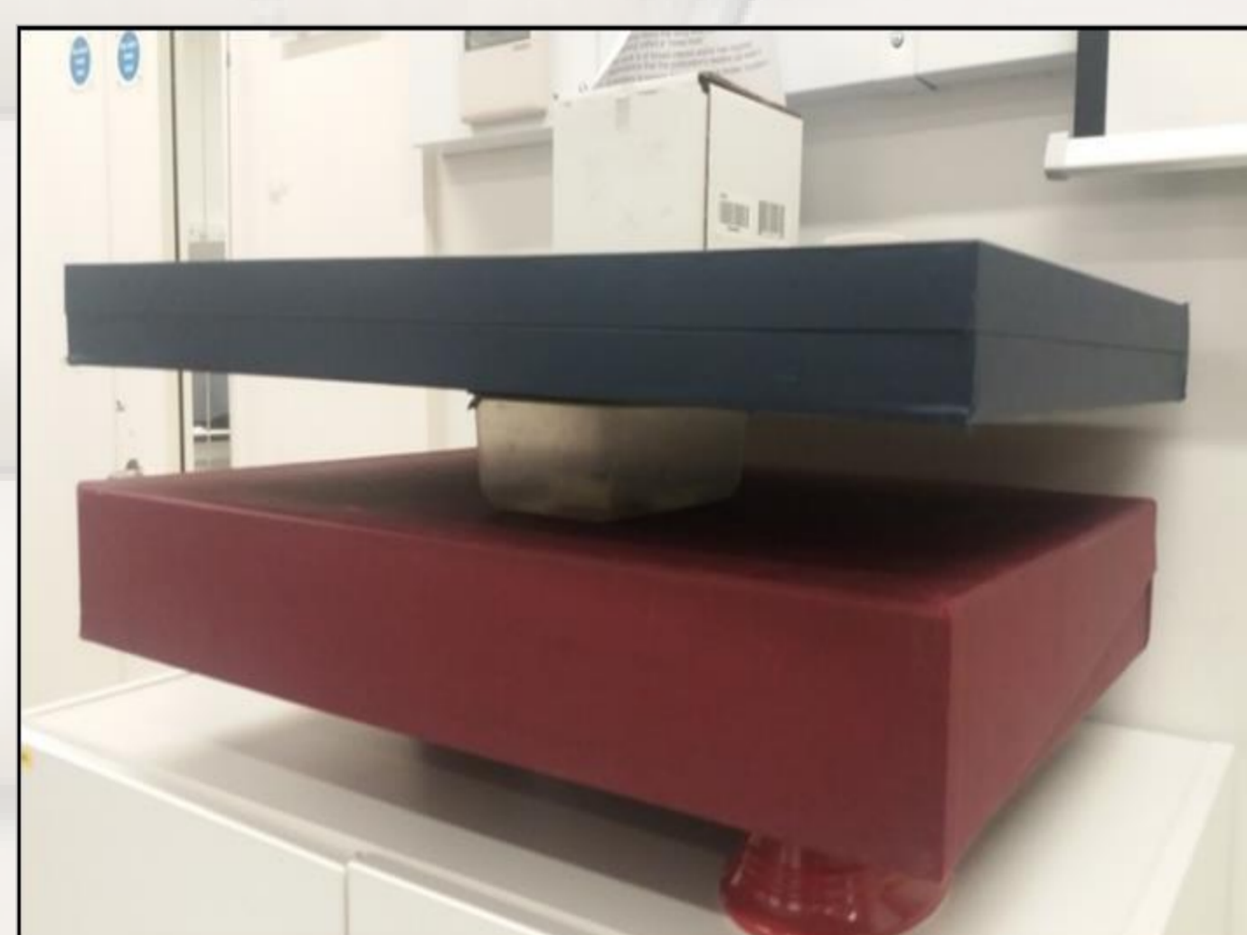
Fig 1. Boxes used in the monitoring experiment

Cardboard, Solander and plastic box were used in preliminary experiment (Fig. 1). Monitoring was carried out for 2 weeks and data was collected every minute. Boxes were exposed to changing external environments to see how they influence microenvironment in box. Boxes were first empty and then filled with print paper. From humidity values air exchange rates for each box were calculated and model plots were created using AER and humidity values. 4