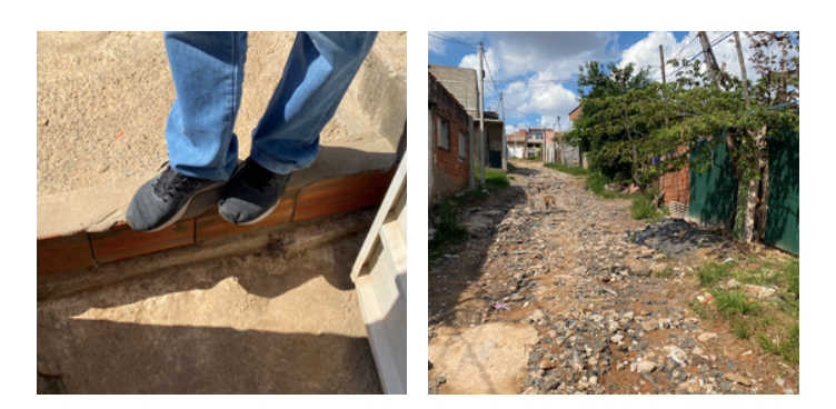
Figure 4: coping strategy to avoid flooding inside the house (left) and street in precarious situation after heavy rain (right).

Municipal plans and supply indicators tend to treat the city and its inhabitants in a homogenous way disregarding the heterogeneity of informal settlements and the prevalence of alternative sanitation solutions. Lack of a disaggregated exploration and articulation of linkages between sanitation and other key issues means that risks cannot be systematically addressed and synergies are likely to remain untapped. Previous research highlights the importance of gender and intersectional considerations to understand differential vulnerabilities so as not to exacerbate