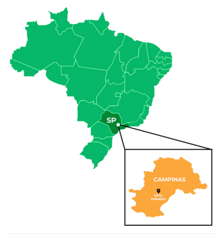
Figure 1: Location of Campinas and Sítio Paraíso.

Based on the New Legal Framework for Basic Sanitation (Law 14026/2020), which stipulates universal access by December 2033 (measured as 99% of the population with access to water and 90% for sewage collection and treatment), Campinas has already achieved universalisation of basic sanitation services. While the Framework allows for a 10% deficit in access to sanitation, SANASA and the Municipality are more ambitious, aiming for 100% access and treatment by 2025 (SANASA, 2021).