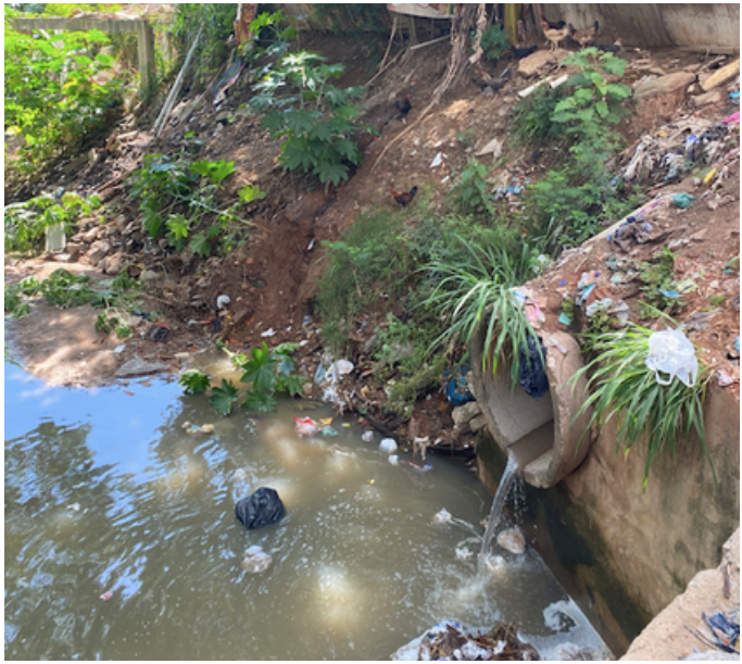
Figure 2: Local stream contaminated with liquid and solid waste.

4) Simple pits with different construction techniques.