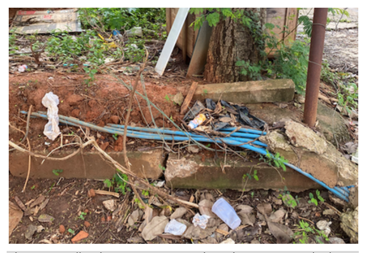
Figure 3: Collective water connection pipes prone to leakage and contamination.

water connections and considers both as adequate access. This masks significant inadequacies and intra-settlement variations observed during fieldwork. Together with the fact that service provision is dependent on land regularisation, which SANASA lacks influence over, this might explain why specific (and diverse) sanitation strategies for the context of informal settlements are lacking (targets 6.1-3, 10.2-3, 11.7, 11.b).