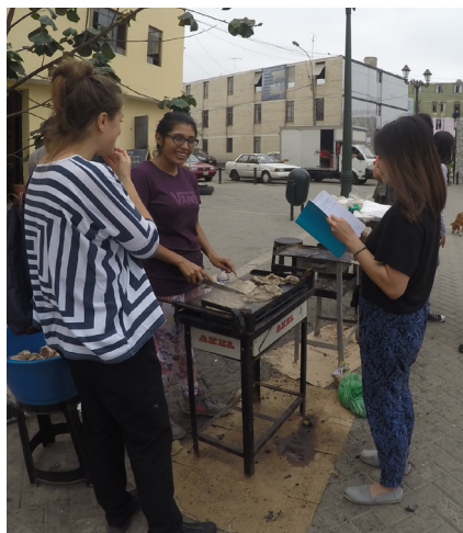
Figure 5. Members of the youth group Movimiento Autonomo Popular with DPU students

Quintas were designed for communal living and a collective property model could be envisaged. The Ministry of Housing could formulate a policy that creates incentives for the use of property for social purposes, such as housing for low income groups. These could be modelled on collective property models like that of the Federación Uruguaya de Cooperativas de Vivienda por Ayuda Mutua (FUCVAM) , originating in Uruguay and now widely used all over Latin America. This model is based on key prin-