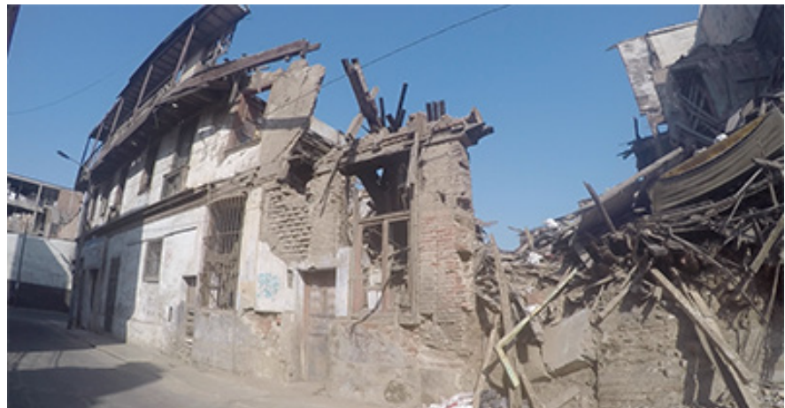
Figure 4. Collapsed house in El Buque, Barrios Altos, April 2016

Prevention, needs to address the following themes: Monitoring, capacity building, and inter-institutional data exchange.