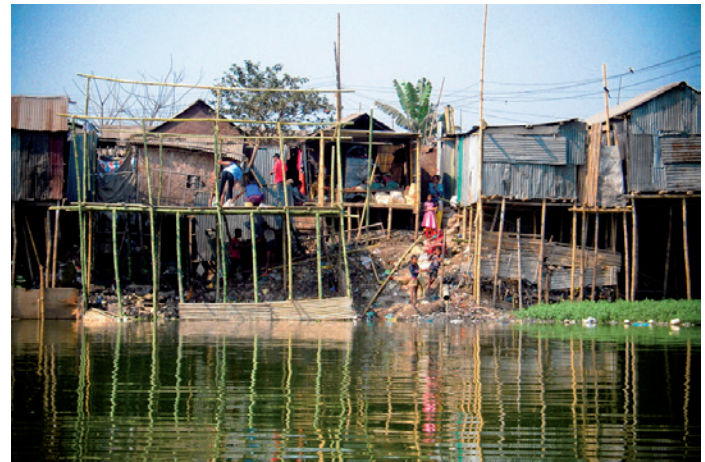
Right: Hazardous living conditions of the urban poor in Dhaka, Bangladesh (Huraera Jabeen)

Pelling, M. (2012). The Vulnerability of Cities: Natural Disasters and Social Resilience. Oxford: Routledge.