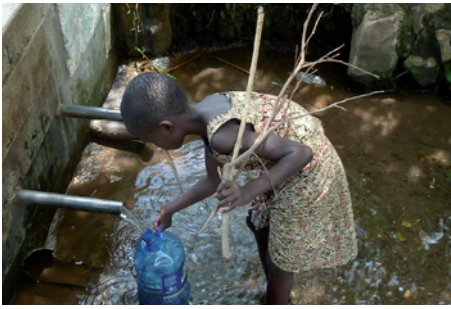
Above: Protected water spring built by the PPP project in Kisumu