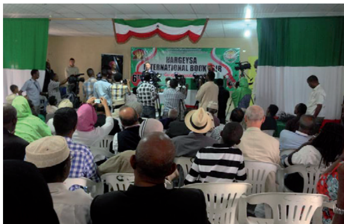
Left: The audience at one of the sessions of the Hargeysa International Book Fair, Somaliland in August 2013