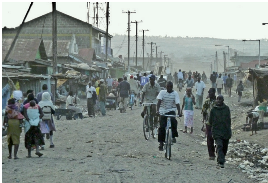
Above: The unjust distribution of environmental 'bads': poor sanitation and pollution in low income areas of Nakuru, Kenya.

However, it is vital to emphasise that resilience does not a priori have this effect, and might even have an inverse effect. Could it be the case that a city's resilience-enhancing measures have embedded within them the same injustices already taking place in the city? What if the process of increasing the resilience of the city as a whole happens at the expense of the rights of certain