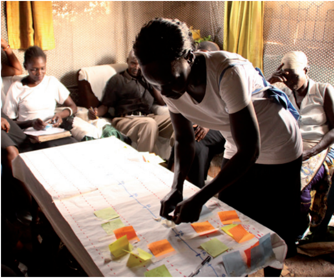
Left: Participatory research during the SDP Kisumu fieldtrip (Moe Saw)

development planning, students found that a technocratic bias continues to hamper efforts to deliver more equitable access to water and sanitation for poor slum dwellers. The LASDAP framework confines participation primarily to the identification of problems and excludes residents from key decisions concerning project design, creating a risk that implemented projects will be inappropriate to the needs and lived-realities of different groups of residents. While PA's PPP model offers much more extensive participatory opportunities, some evidence (for example, where an eco-toilet was implemented despite strong community resistance to composting) suggested that PPP could also benefit from a greater focus on community involvement at the design stage.