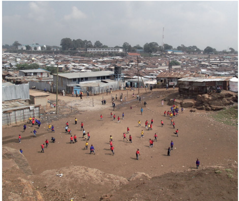
Above: Social capital as a resource in urban communities: Teamwork in Mathare, Nairobi