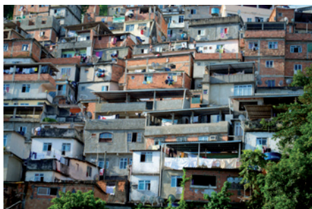
Above: Hazardous living conditions of the urban poor: Rio de Janeiro

The literature that touches upon this relationship has looked mostly at the uneven social distribution of exposure to environmental risks, exploring this in isolation from the environmental justice literature. Walker et al (2006), for example, have reviewed the environmental justice literature that discusses the social distribution of exposure to flood risks. This also goes down to the household level, as the poor are not only forced to live in hazardous areas, but also in precarious housing structures, and have lower economic capacities to deal with the impacts of disasters. What is important to