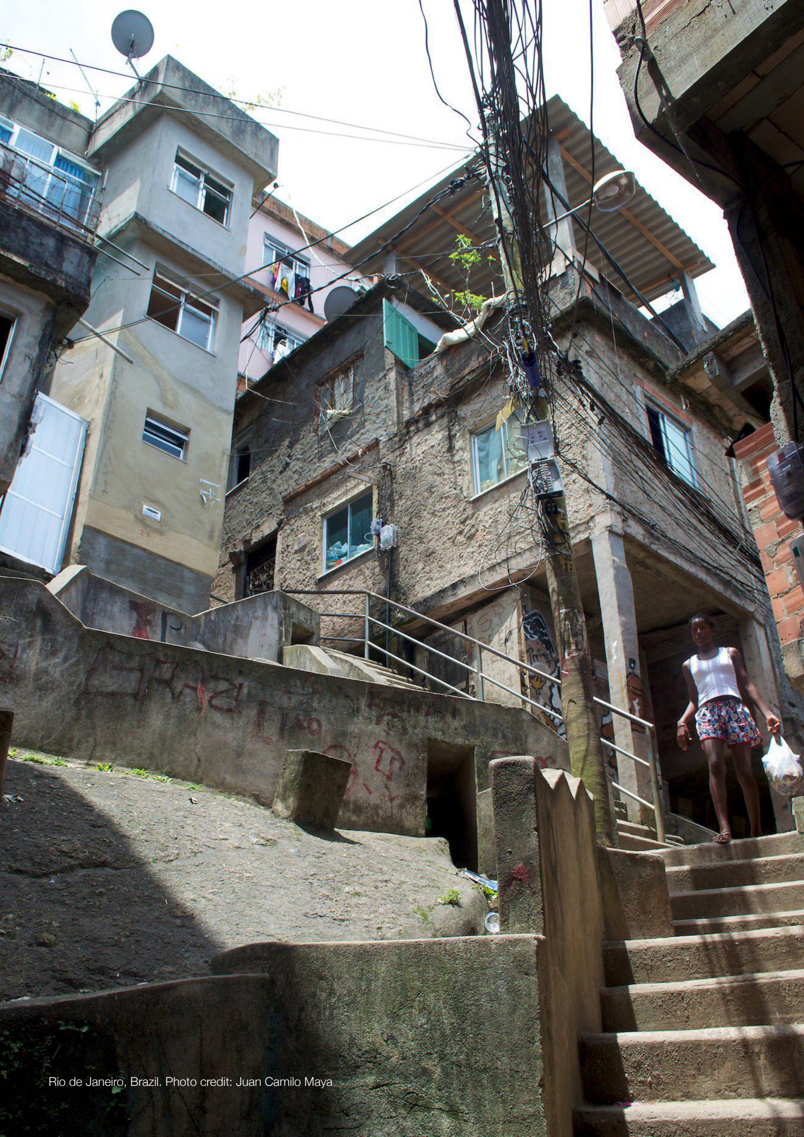
Rio de Janeiro, Brazil.