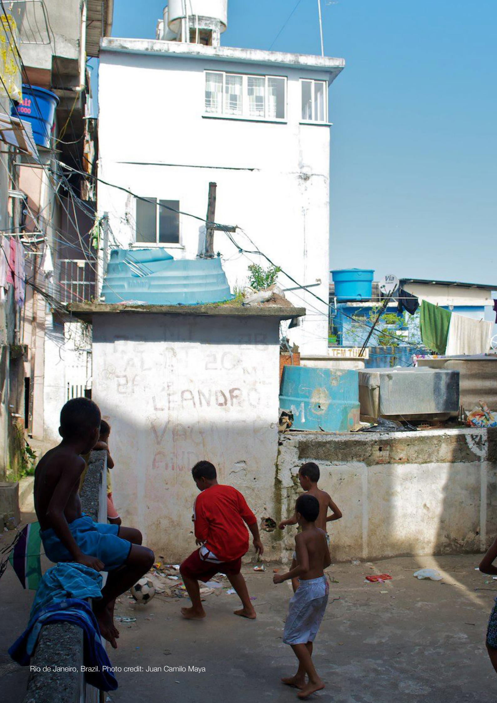
Rio de Janeiro, Brazil.