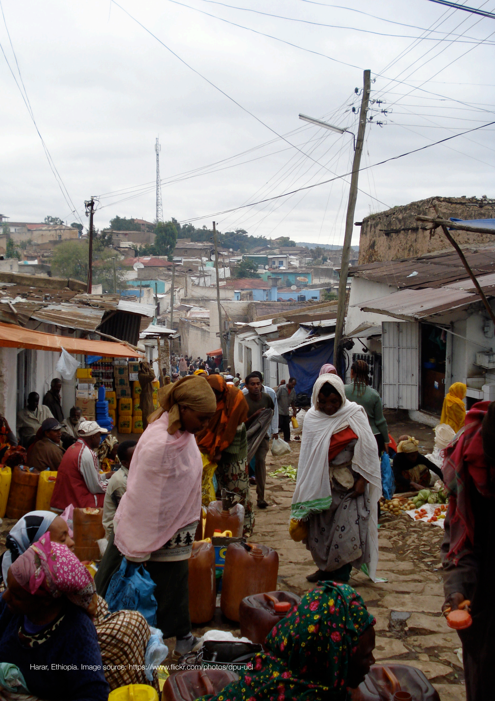
Harar, Ethiopia.