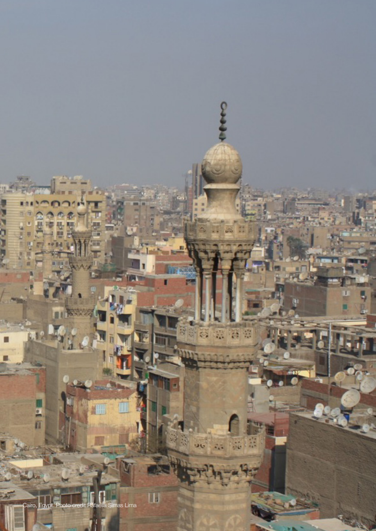
Cairo, Egypt.