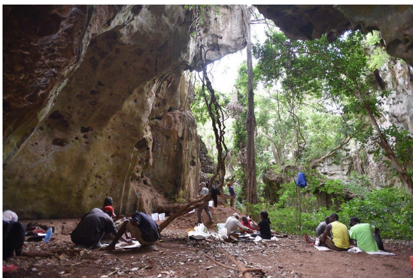
Excavations at Panga ya Saidi in Kenya – C. Shipton