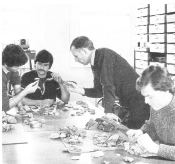
A Roman pottery seminar at Gordon Square

Today the Institute provides first degrees in archaeology instead of postgraduate diplomas, as was the case up to 1968, and its field training programmes are linked with rescue archaeology projects, funded until recently by the Department of Environment's Directorate of Ancient Monuments and Historic Buildings – a function which has now passed to the newly formed Historic Buildings and Monuments Commission, chaired by Lord Montagu of Beaulieu.