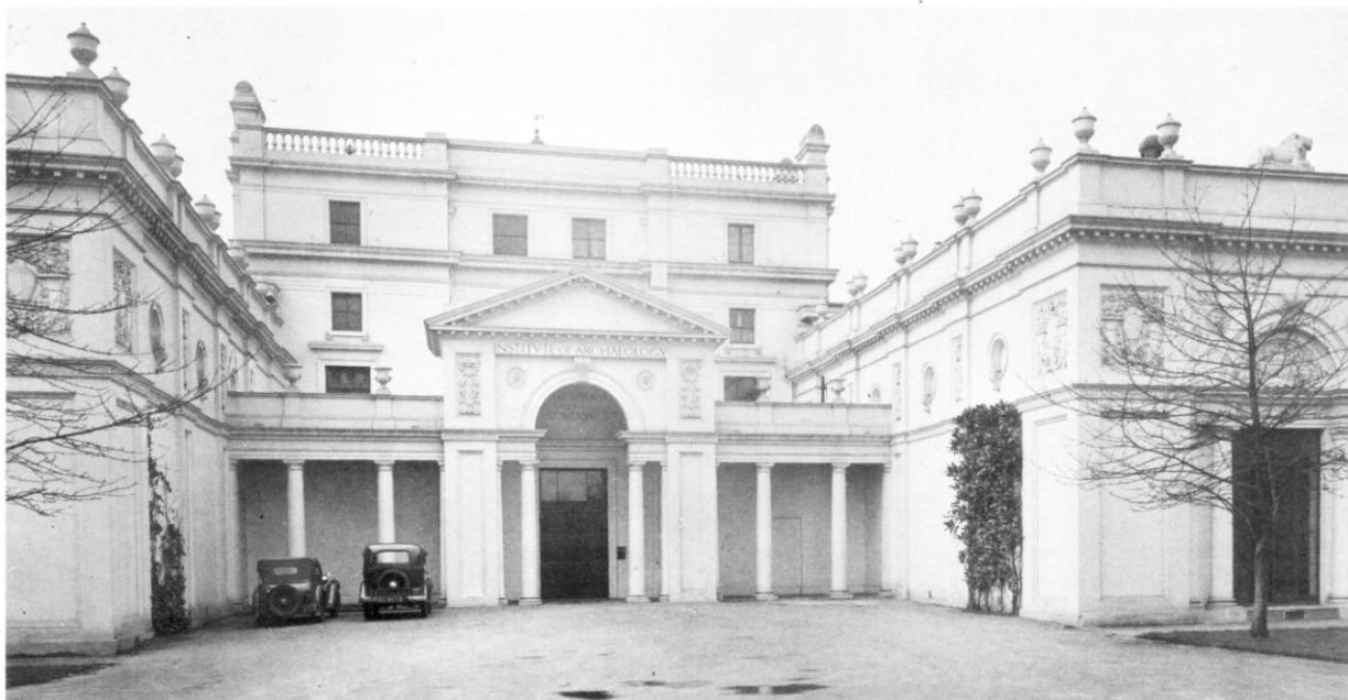
St John's Lodge, in London's Regent's Park, the headquarters of the Institute of Archaeology for its first 22 years. In 1956 a move was made to the present premises in Gordon Square (below)