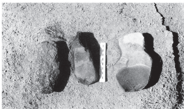
Fig. 4. Grooved hammer stones from the Predynastic gold mine at Bakari.

makes Bakari a unique site for the history of gold mining world-wide.