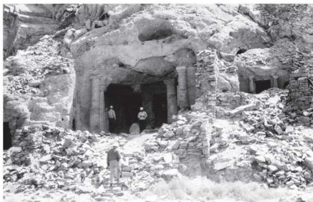
Fig. 3. The partly rock-cut temple at the Sikeit emerald mines.

site. Nevertheless, the complete range of the date of the activities at the site will have to await the proper study of the site and its pottery.