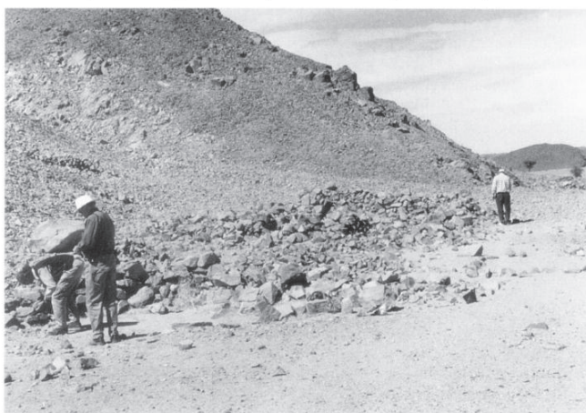
Fig. 1. The iron and copper smelting site at Hamash.

1. Following the International Conference on Archaeo-metallurgy held in Cairo in April 1995, initiated and co-sponsored by IAMS London, the first steps were taken to set up an Egyptian Centre of Archaeo-metallurgy. It was decided to centre this organisation around a major, long-term archaeo-metallurgical field research project, which will also become a 'training ground' for students in field research methodology and the scientific processing and conservation of metal-related archaeological finds. For this purpose, the Egyptian authorities, represented by the Supreme Council of Antiquities (SCA) Egypt and the Egyptian Geological Survey and Mining Authority (EGSMA), in collaboration with the Tabbin Institute for Metallurgical Studies Helwan, (Tabbin), the Institute of Archaeology (IA), University College London, the Institute for Archaeo-Metallurgical Studies (IAMS), University College London and The Royal School of Mines (RSM), Imperial College of Science, Technology and Medicine, London, formed an international working group consisting of Professor C. Tim Shaw (RSM), Professor Beno Rothenberg (IAMS), Professor Fekri A. Hassan (IA), Dr Abdel Aziz A. Hussein (EGSMA), Professor Dr Sayid Khalil (Tabbin), Dr Kamal Barakat (SCA), Professor Dr Kamal Hussein (Tabbin), Dr Mohammed el Huwari (EGSMA), Mr Attiya Makhoulf (EGSMA).