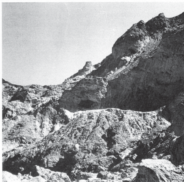
Fig. 2. Mining waste heap, behind it mineworking, later used as habitation.

Site 38 is a very large mining complex which has been worked by inclined galleries and vertical shafts, and later