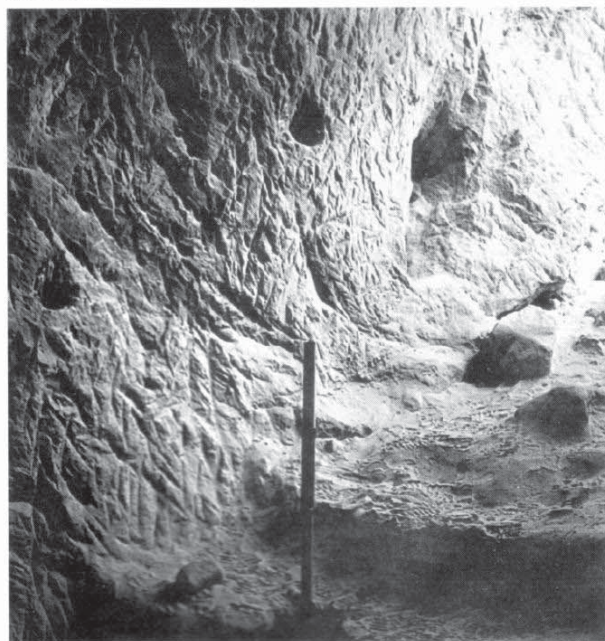
Fig. 6. Steps and lamp niches in the underground workings. Note the tool marks on the wall.