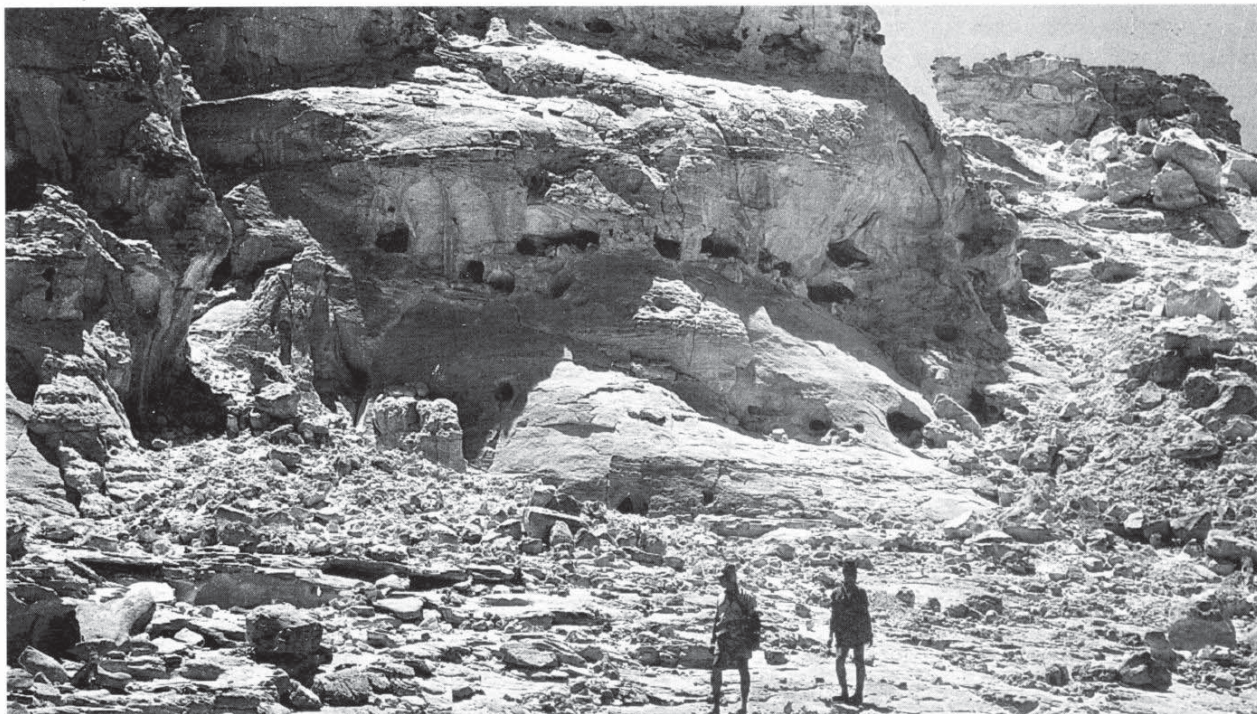
Fig. 1. Wadi Amram Site 33: The Chalcolithic and Late Bronze Age (New Kingdom) mine on top of the cliff. Note the small boreholes next to the larger gallery opening.

tourist attraction. Here quantities of Roman to Early Islamic and later pottery was found. The site was the main objective of our recent fieldwork because no Roman to Early Islamic mine workings had been systematically investigated before in the southern Arabah; in fact, no mines of these periods have so far been surveyed anywhere in the Ancient Near East.