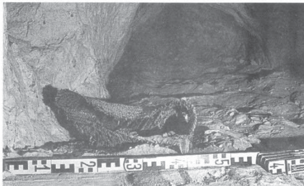
Fig. 5. Basket from the Roman workings (near Stn. 1124).

Most of the early mine workings were cut through by later work (see Fig. 4), which partly reused old passages. Whereas the older ramifications were small, following, we can presume, richer ore, they later cut through much, or the whole, ore-bearing bed, and are one to three metres high. Pottery found in the workings, identified by M. Gichon, of Tel Aviv University, as Roman, Byzantine, Early Islamic, Islamic 8th–9th century and, even much later, Mamluk and Ottoman, indicates at least two and most likely even three phases of later work. Byzantine