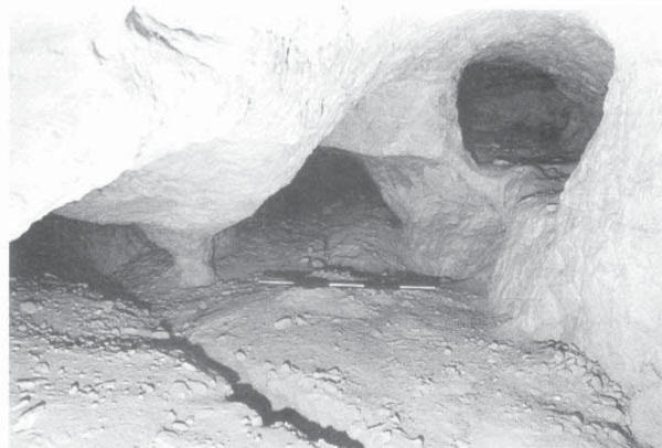
Fig. 4. Underground workings (seen from Stn. 803); the right gallery appears to have been cut by the later, larger workings. At the left pillar working.

places along the outcrop of the beds in the adjacent tributary valley.