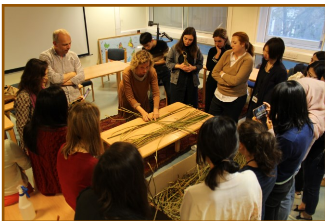
Making Workshops, 2018: Basket-weaving and Woodcarving.