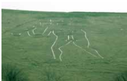
Cerne Abbas Giant