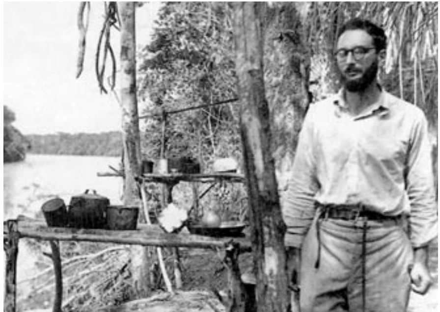
A young Lévi-Strauss in Amazonia, c.1953

Still, the question remains as to what we are to make of the formula. Is it mainly a fetishisation of the natural sciences and mathematics, an imperialistic claim of Western intellectualism over the "mind of the primitives"? In the first chapter of The Savage Mind (1966), Lévi-Strauss famously argues that scientific and