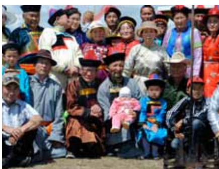
Top: Summer party for elders Left: Local naadam celebration Right: Delivering milk for sale

www.ganhuyagchh.blogspot.com/2010/10/wolf-economy.html