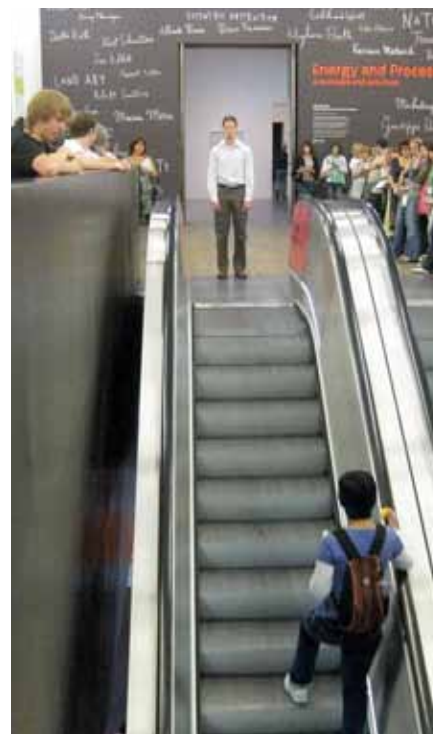
Conveyor, performance at Tate Modern, 2009

Which of your works are you most happy with?