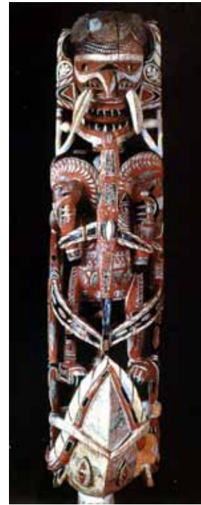
Above: Malanggan Figure