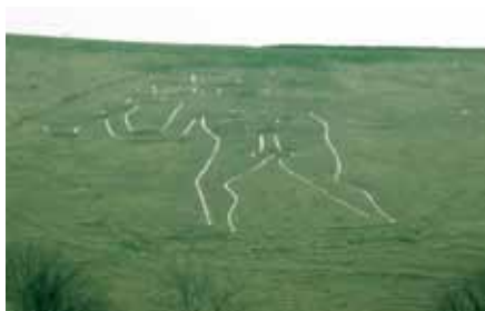
Cerne Abbas Giant