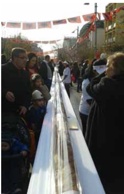
Left: 100m long breadloaf served in Prishtina during Albanian's Independence Day - 28 November 2012

Both interviews conducted by Paul Carter-Bowman