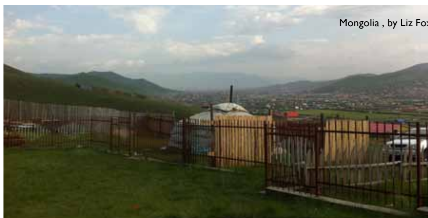
Mongolia, by Liz Fox