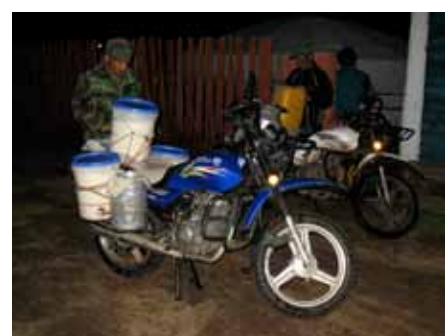
Top: Summer party for elders Left: Local naadam celebration Right: Delivering milk for sale

www.ganhuyagchh.blogspot.com/2010/10/wolf-economy.html