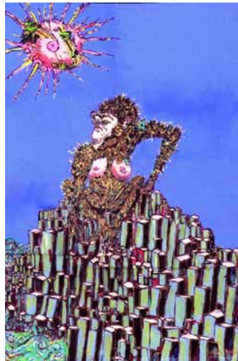
“Chumanpanzee” – A Human-Animal “Liminal Zone”?

As a student of evolutionary anthropology, I am interested in the grey area between modern human beings and extinct ancestors, as well as between human beings and other great apes. I particularly focus on academic and social paradigms in which one being is categorised as human (read non-animal) and the other, an animal (a chimpanzee, for example). We often pigeonhole our surroundings into such dualistic categories i.e. white/black, nature/culture, we/they, human/animal. Often one side of a dichotomy has more power in such ‘reciprocal alterity’ (e.g. heterosexuals generally have more rights and are accorded more “humanity” globally than homosexuals).